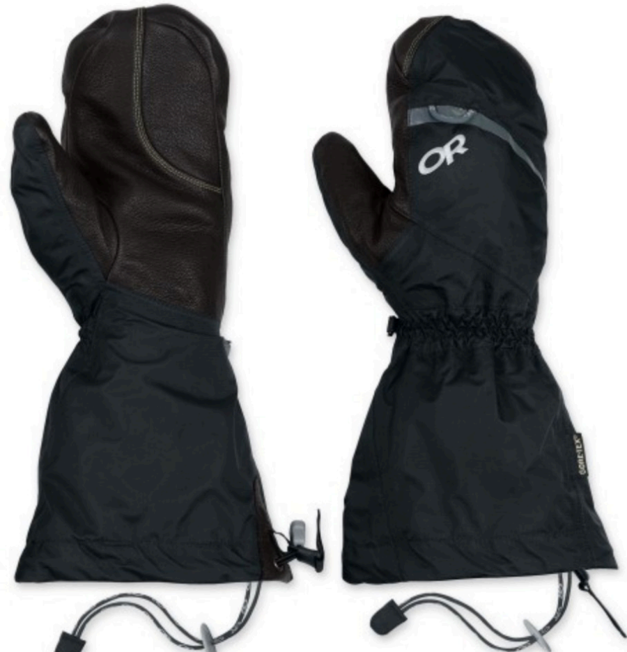
Outdoor Research Alti Mitts