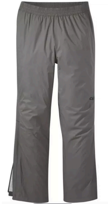
Outdoor Research Men's Apollo Rain Pant