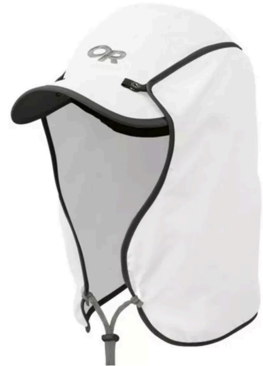
Outdoor Research Sun-Runner Cap