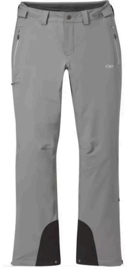
Outdoor Research Women's Cirque II Pants