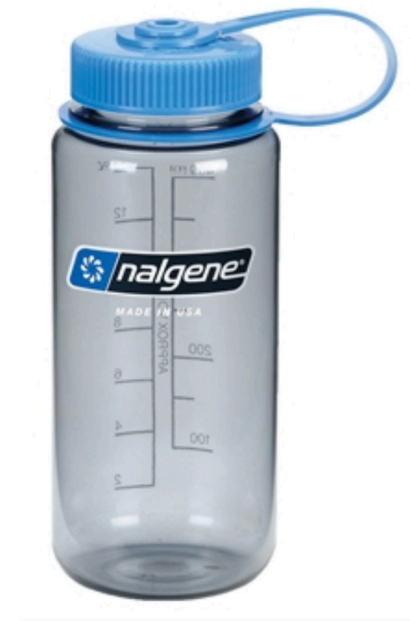
Nalgene 16oz wide mouth