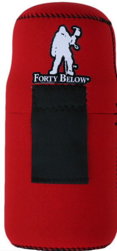
Forty Below Bottle Boot