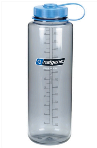
Nalgene 48 oz wide mouth Silo