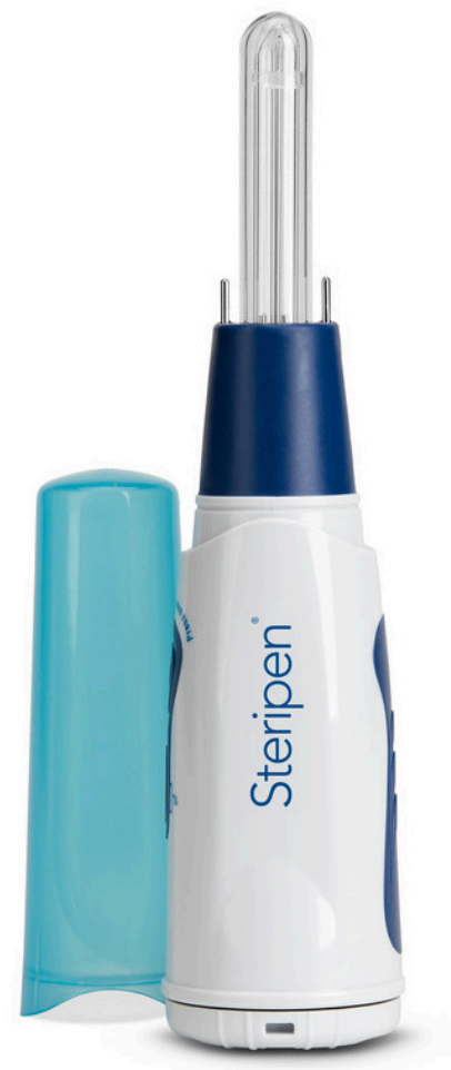
Katadyn Steripen Classic 3