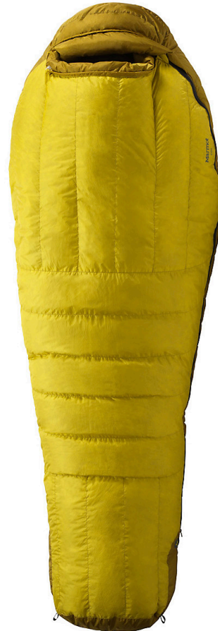
Marmot Col (-20F)