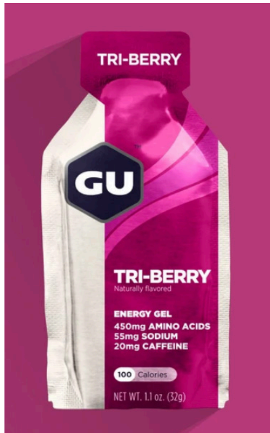
Gu Energy Gels