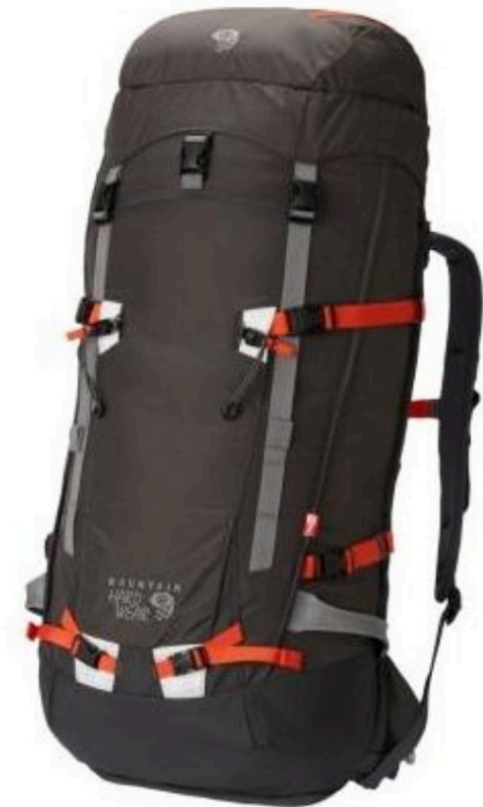
Mountain Hardware Diresissima 50L