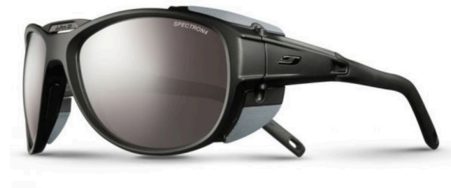
Julbo Explorer 2.0 Spectron 4