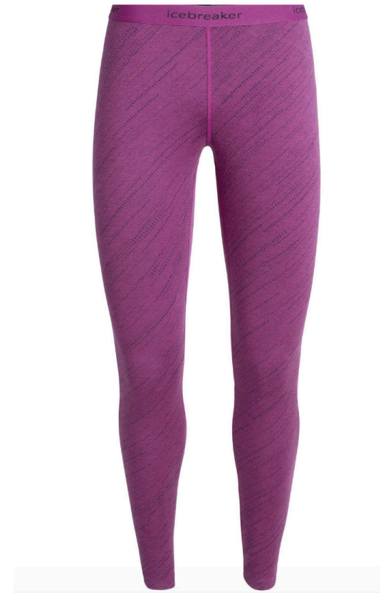
Women's 250 Vertex Leggings Snow Storm