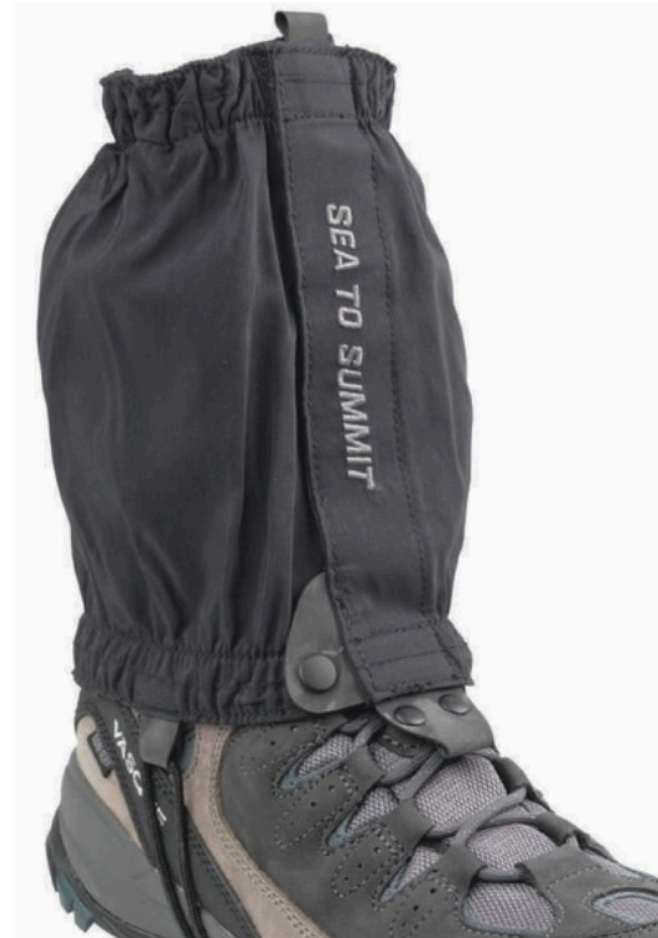
Sea To Summit Tumbleweed Ankle Gaiters