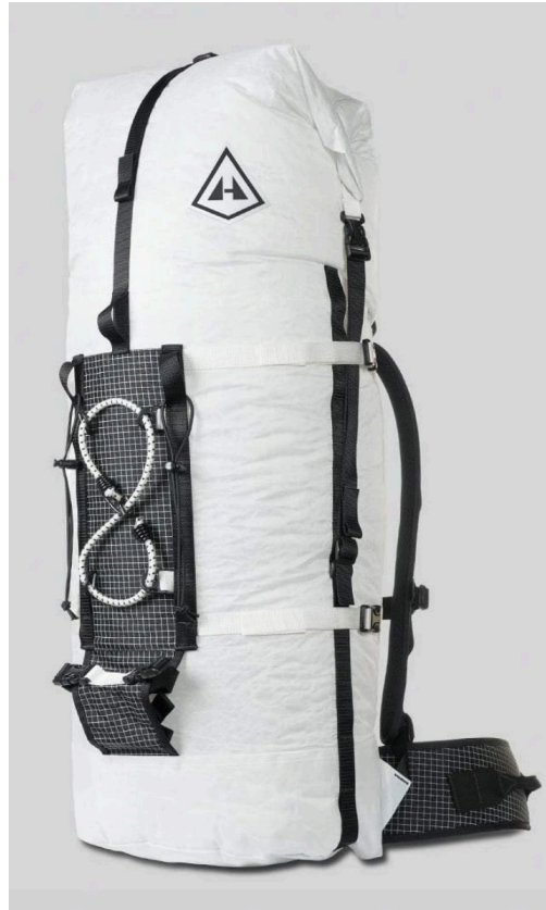
Hyperlite 3400 Ice Pack (55L)