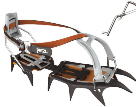
Petzl Vasak 12 point crampons