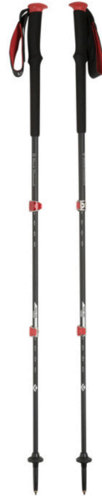
Black Diamond Trail Pro