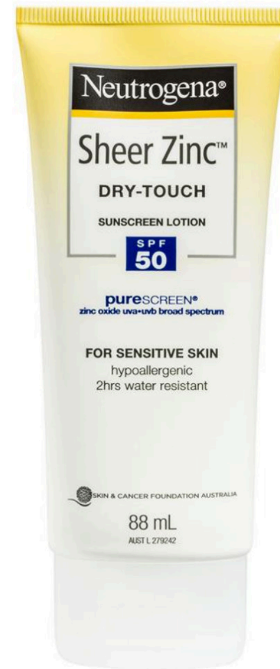
Neutrogena Sheer Zinc