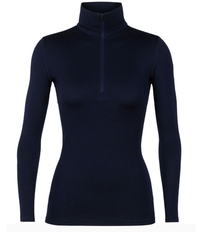
Women's 260 Tech Long Sleeve Half Zip