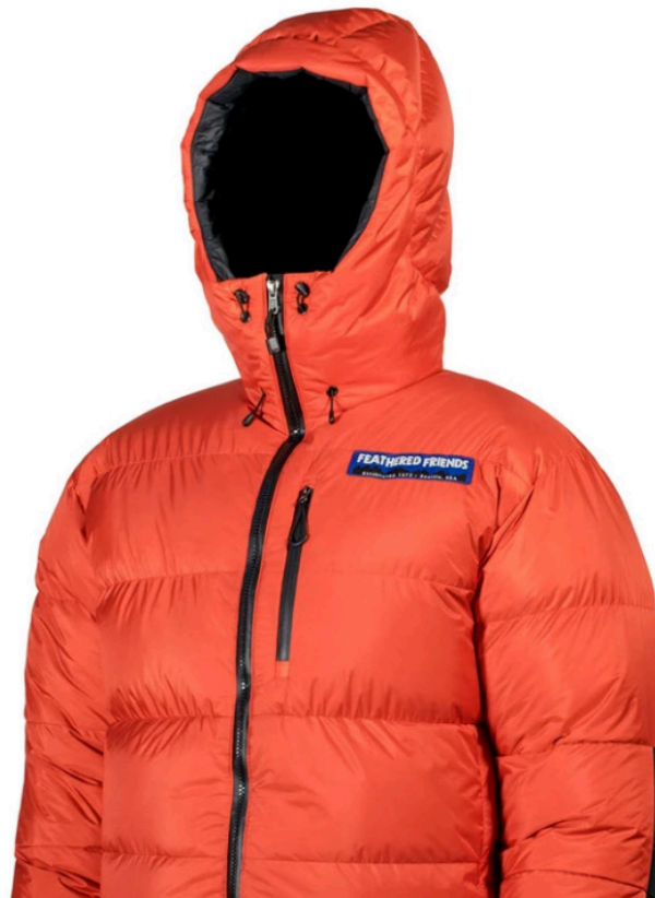
Feathered Friends Khumbu Parka