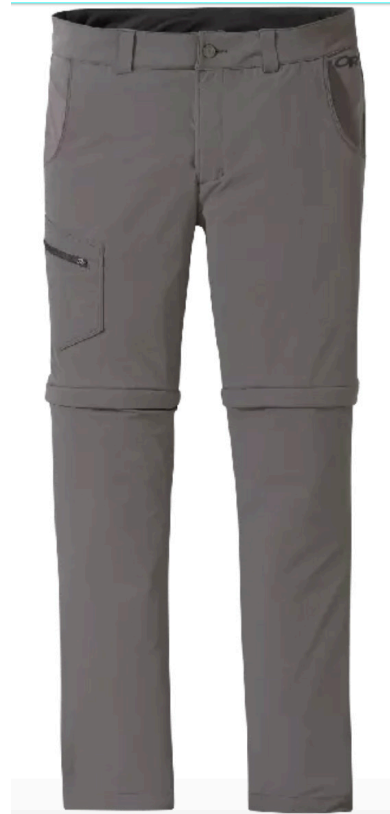
Outdoor Research Men's Ferrosi Convertible Pants