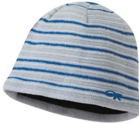
Outdoor Research Spitsbergen Hat