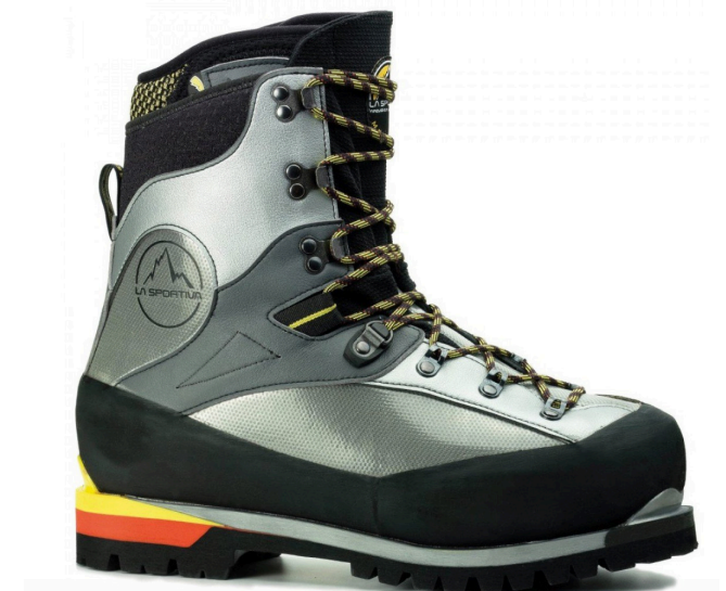
La Sportiva Baruntse