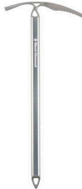
Black Diamond Raven Ice Axe