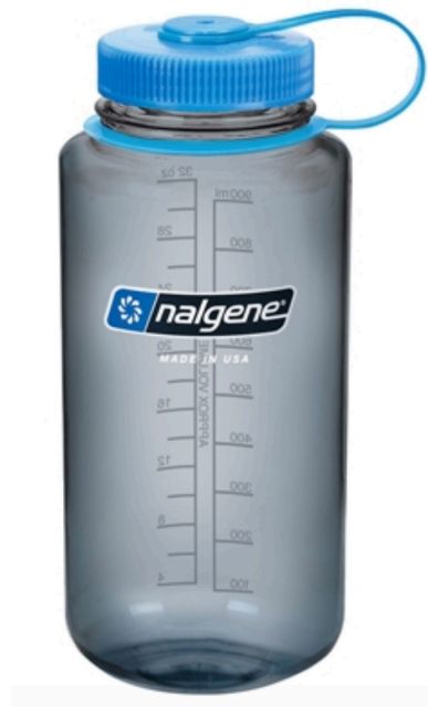
Nalgene 32 oz wide mouth