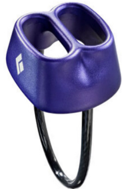
Black Diamond Super 8 AND Black Diamond ATC