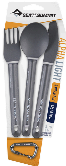
Sea to Summit AlphaLight Cutlery Set