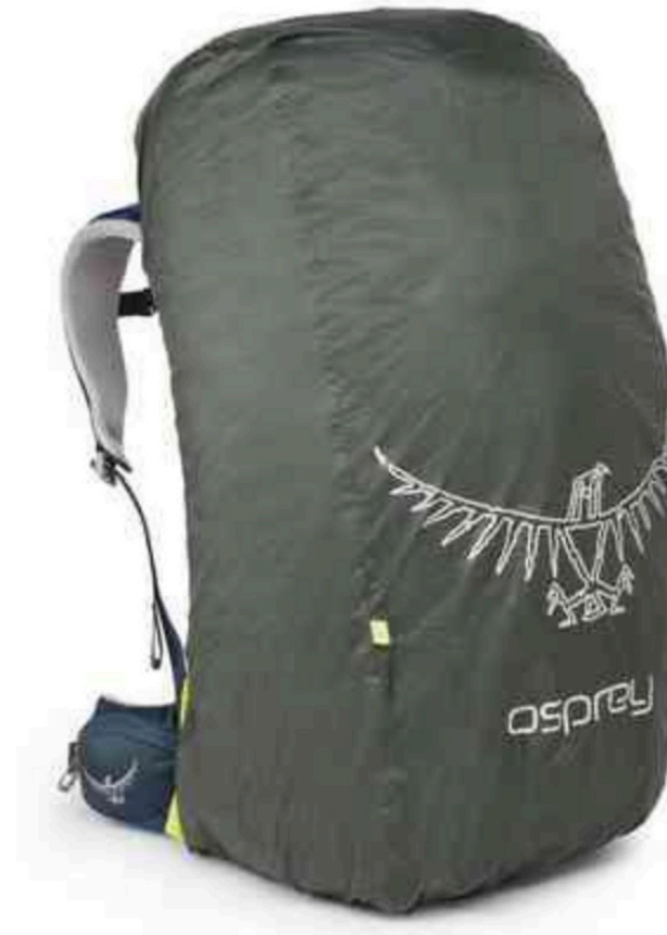
Osprey Ultralight Rain Cover