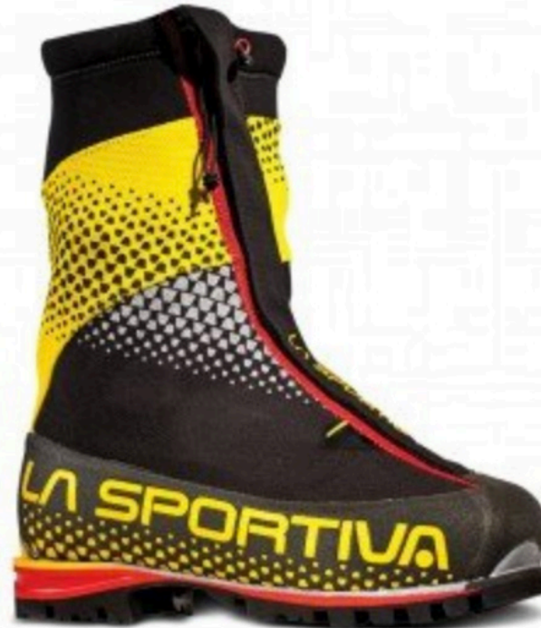
La Sportiva G2SM