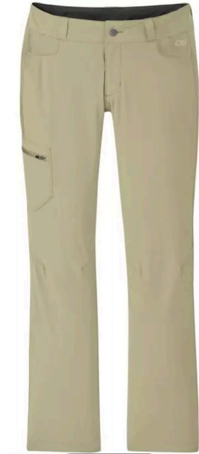
Outdoor Research Women's Ferrosi Pants