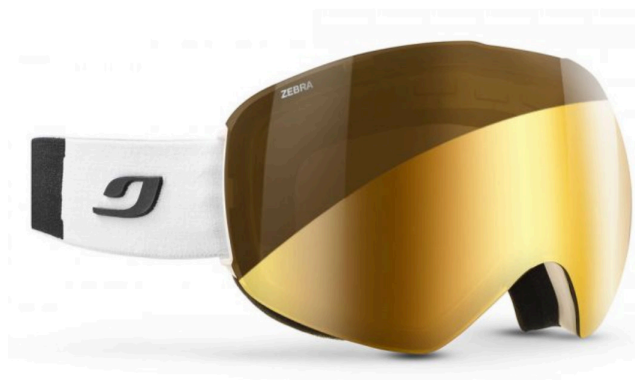
Julbo Skydome Reactive 2-4