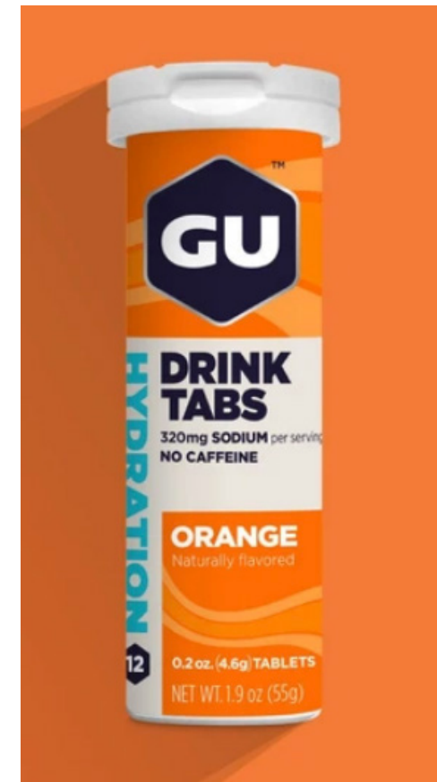
Gu Hydration Tabs