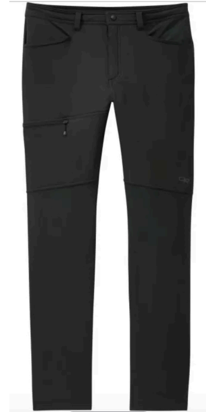
Outdoor Research Men's Methow Pants