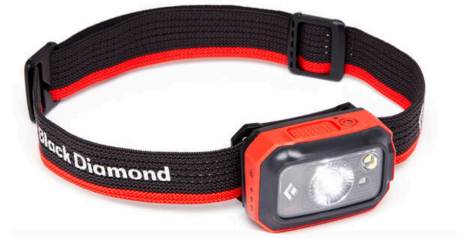
Black Diamond ReVolt 350