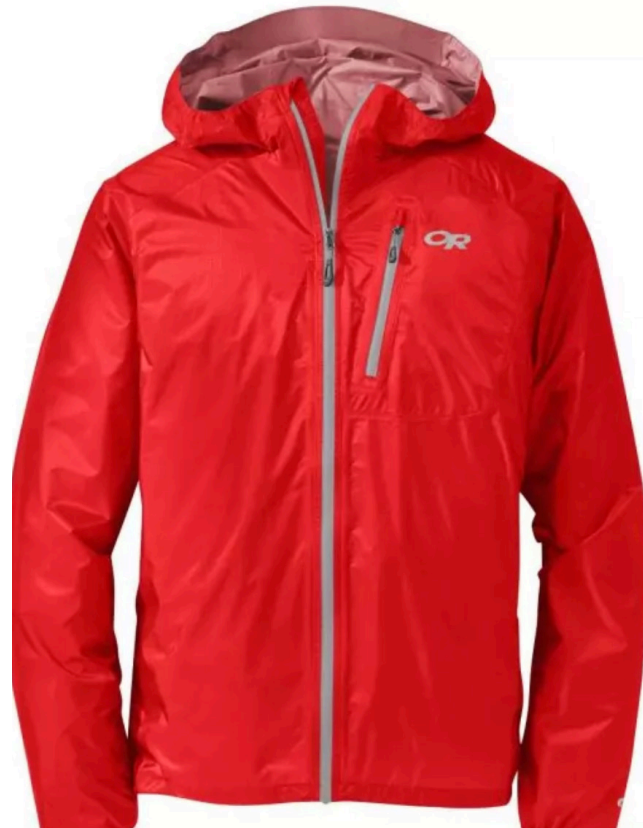
Outdoor Research Men's Helium II Jacket