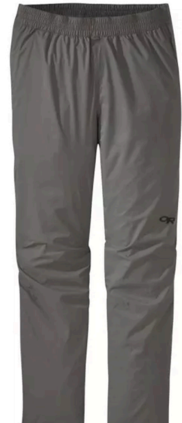
Outdoor Research Women's Apollo Rain Pants