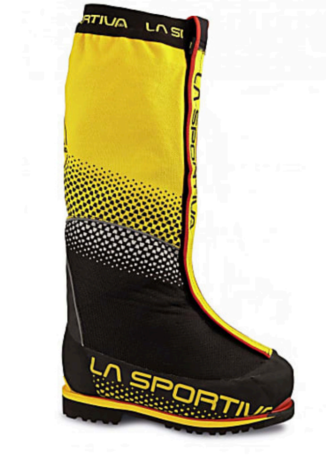
LaSportiva Olympus Mons