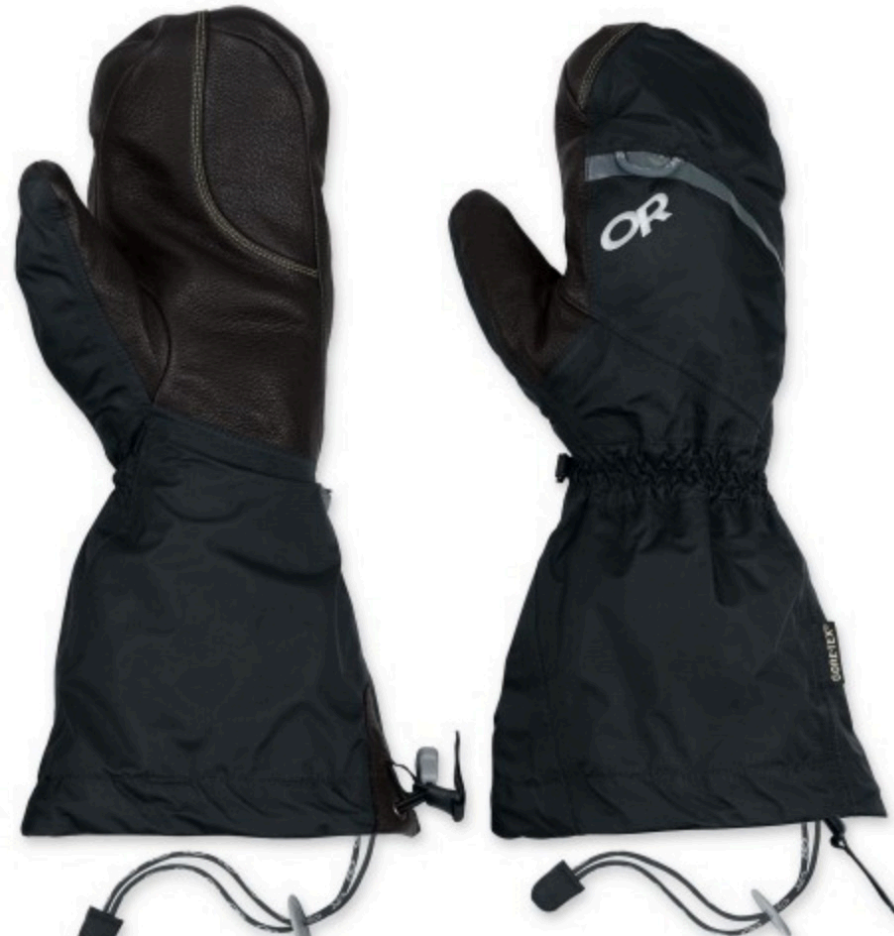
Outdoor Research Alti Mitts