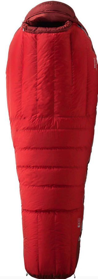
Marmot Cwm (-40F/-40C)