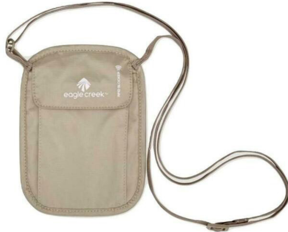
Eagle Creek RFID Blocker Neck Wallet