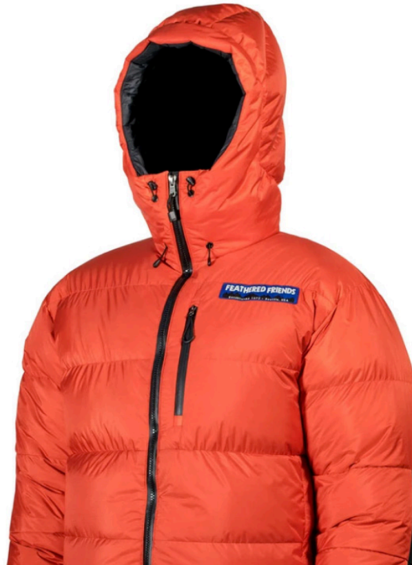
Feathered Friends Khumbu Parka