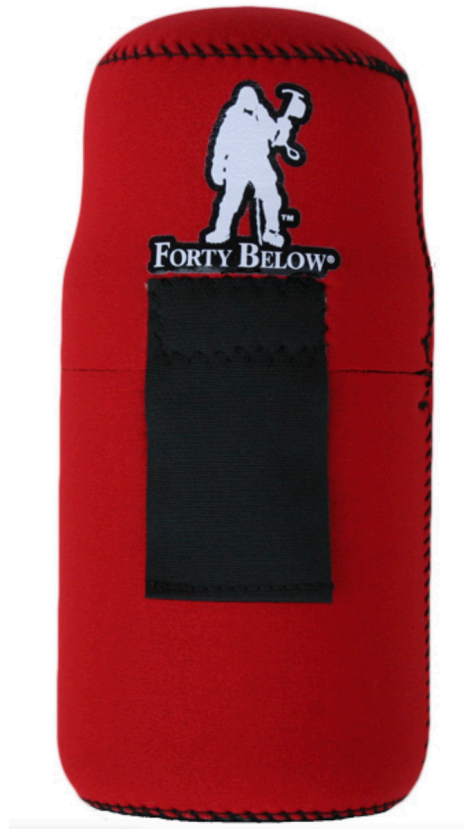
Forty Below Bottle Boot