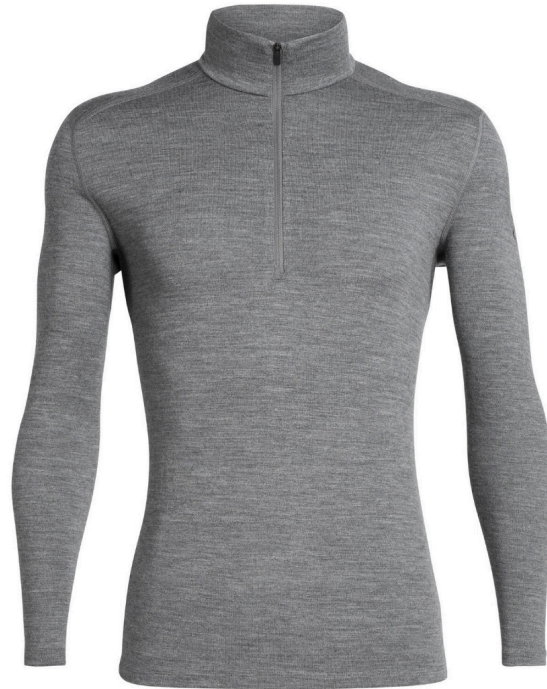
Men's Merino 260 Tech Long Sleeve Half Zip Thermal Base Layer Top