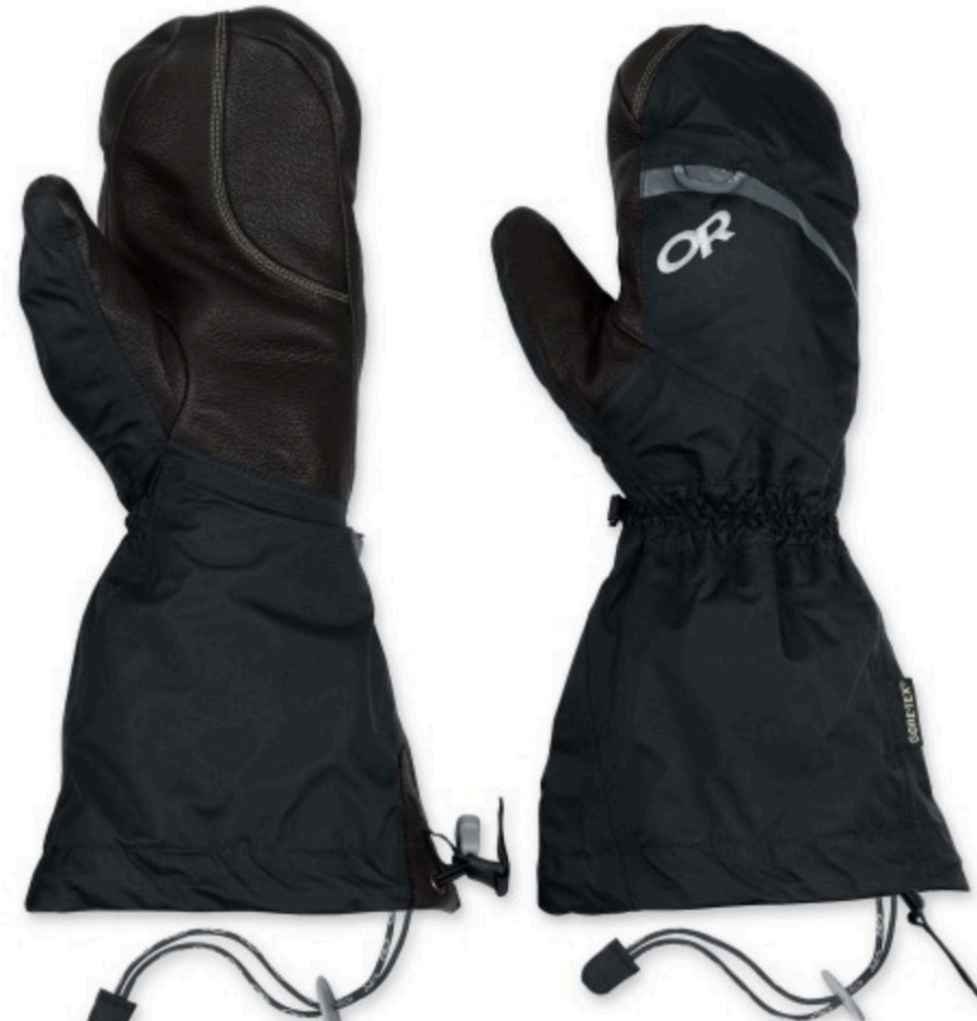
Outdoor Research Alti Mitts