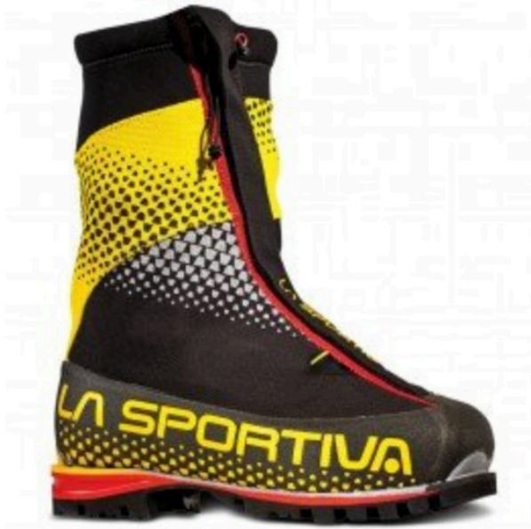
La Sportiva G2SM