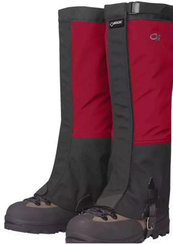
Outdoor Research Expedition Crocodile Gaiters