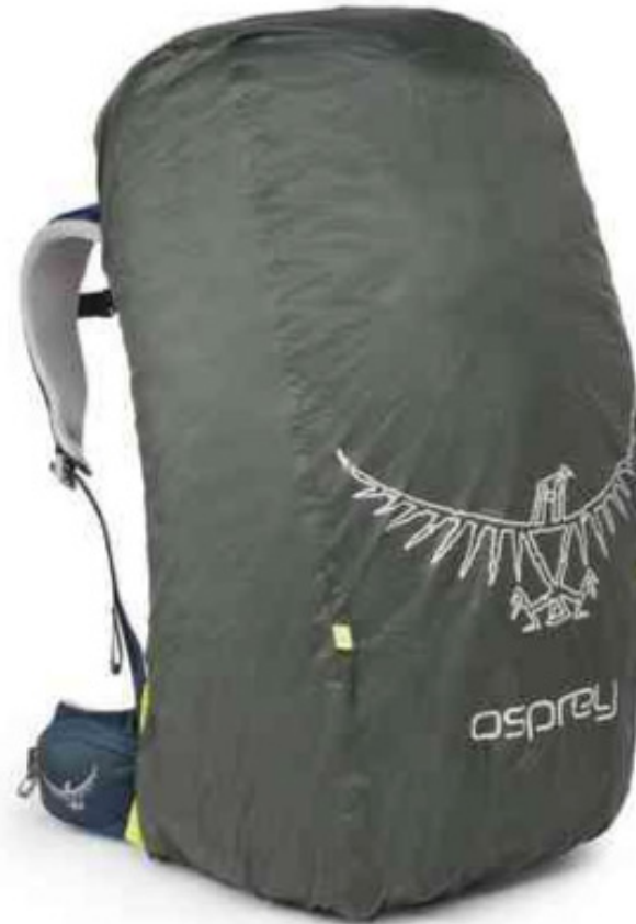
Osprey Ultralight Rain Cover