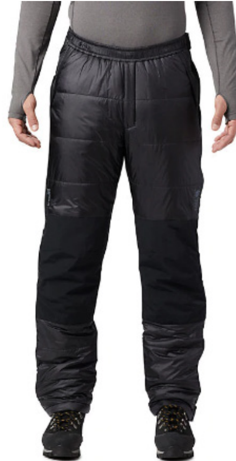
Mountain Hardware Compressor Pants