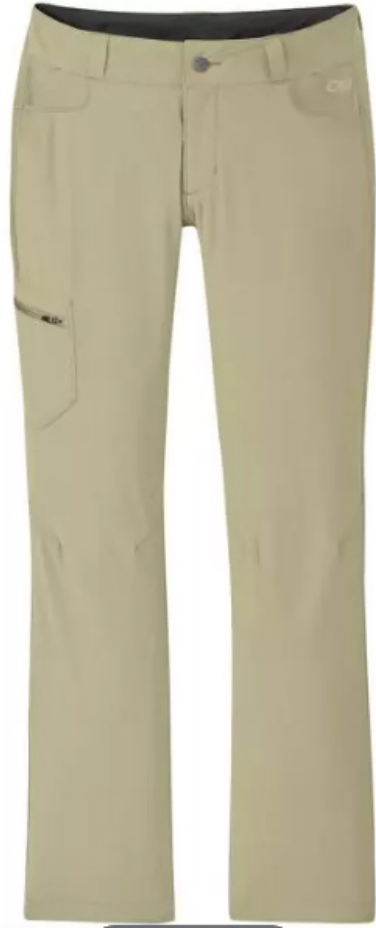
Outdoor Research Women's Ferrosi Pants