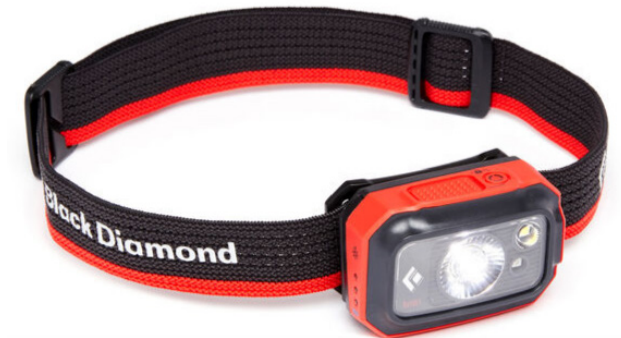
Black Diamond ReVolt 350