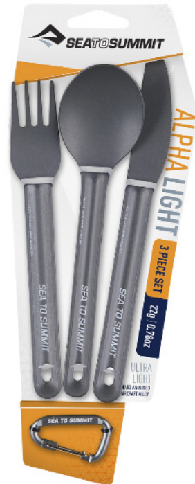
Sea to Summit AlphaLight Cutlery Set