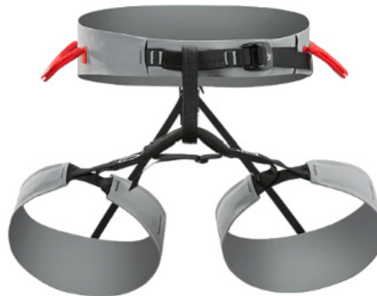
Arc'teryx SL-340 Harness