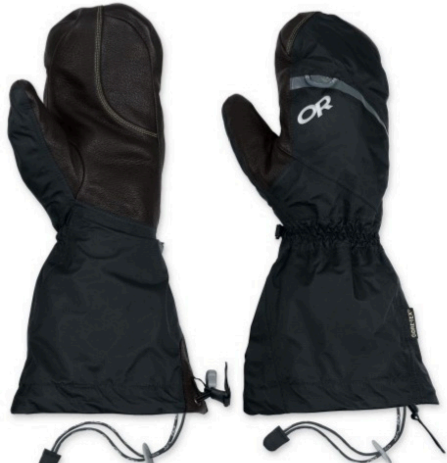
Outdoor Research Alti Mitts