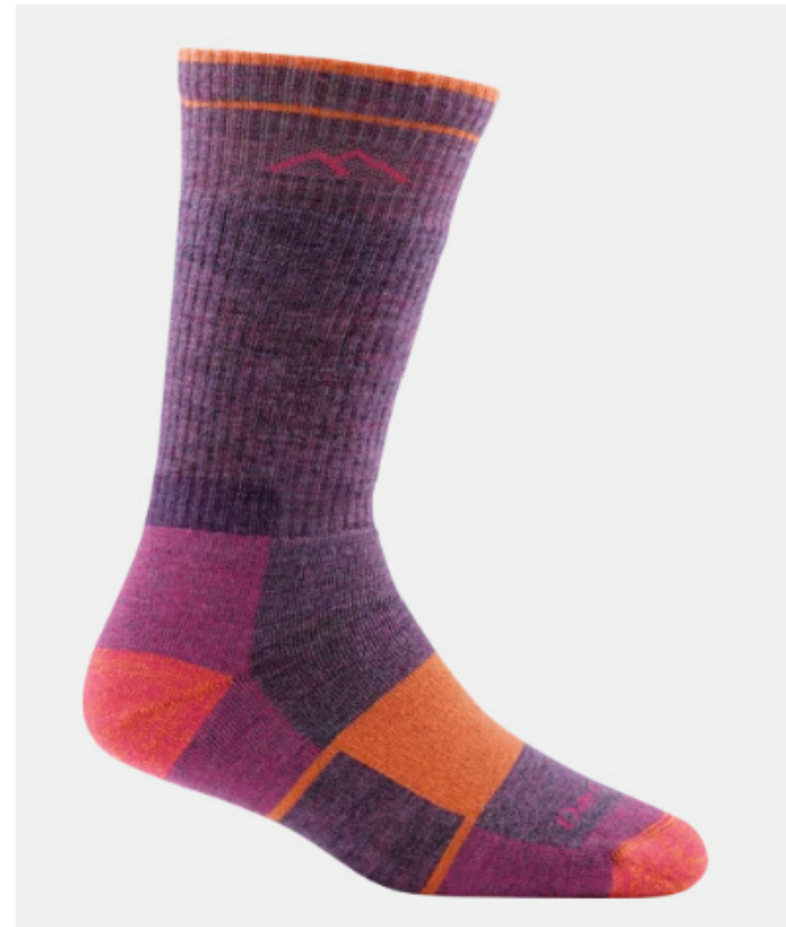
Cushion Darn Tough Hiker Boot Sock Full Cushion