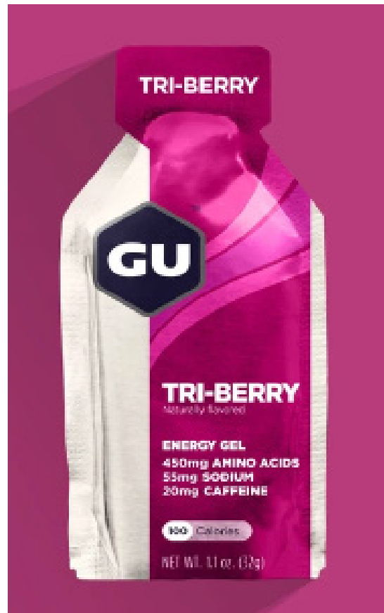
Gu Energy Gels