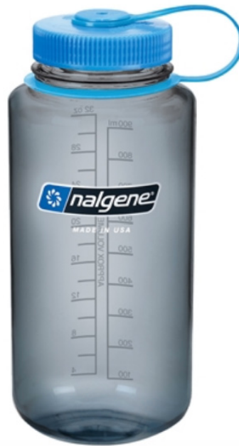
Nalgene 32 oz wide mouth