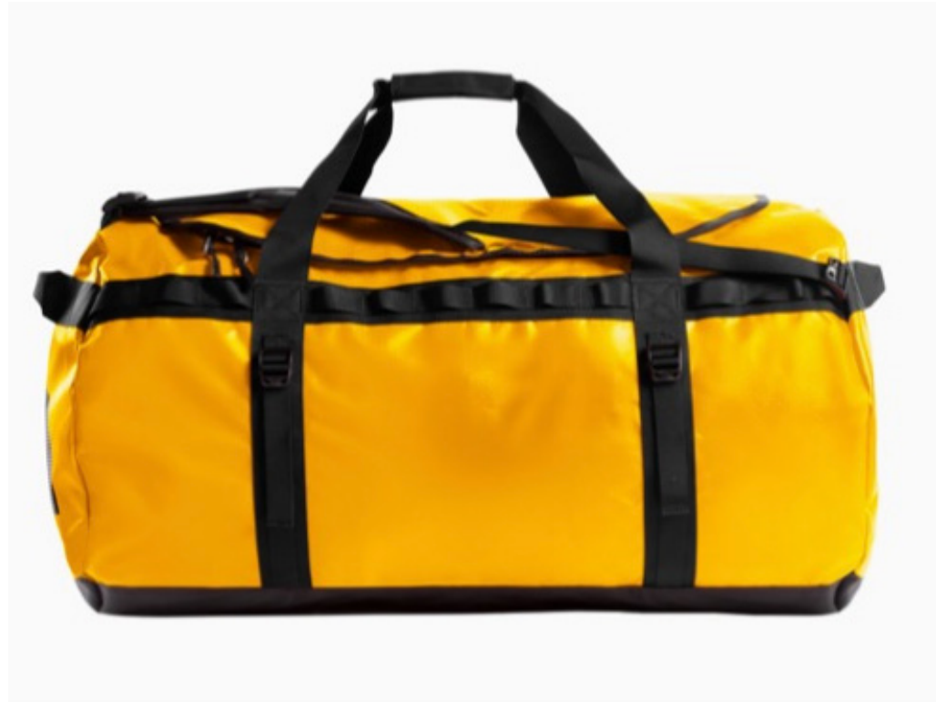
The North Face Extra Large Base Camp Duffel (132L)