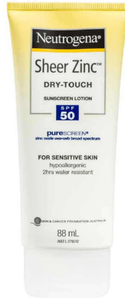
Neutrogena Sheer Zinc