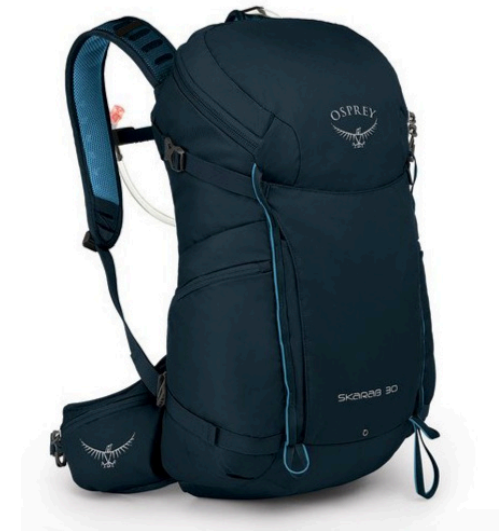
Osprey Skarab 30 (Men's)