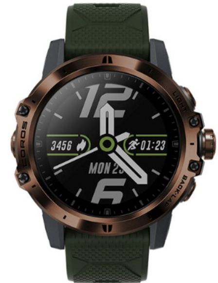
Coros Vertií GPS Watch