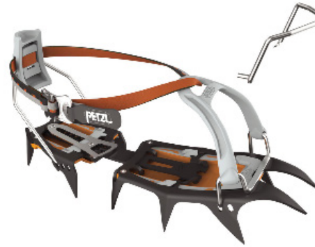
Petzl Vasak 12 point crampons