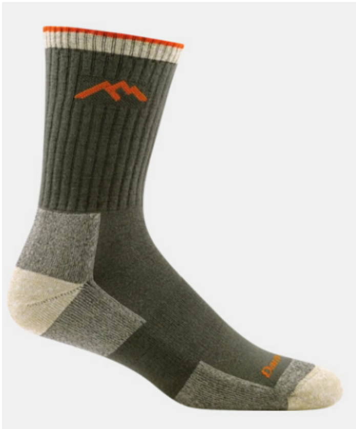
Darn Tough Coolmax Micro Crew