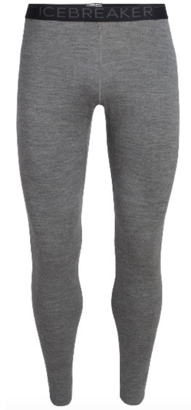
Icebreaker Men's Merino 260 Tech Thermal Base Layer Leggings