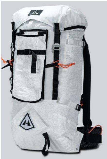
Hyperlite Prism Pack (40L)