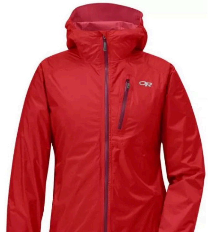
Outdoor Research Women's Helium II Jacket