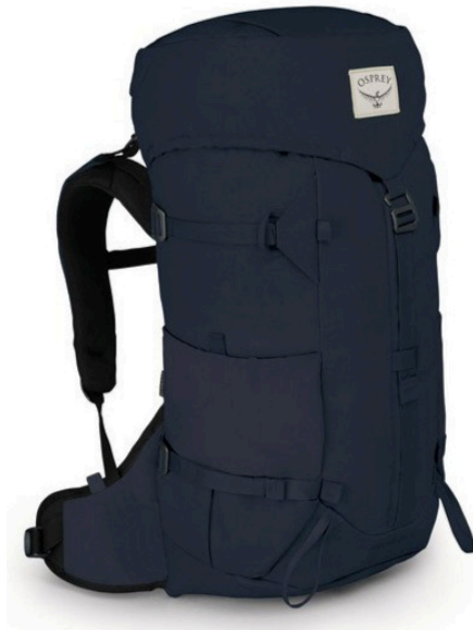
Archeon 30 (Women's)