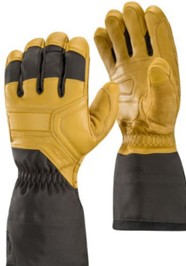
Black Diamond Guide Gloves