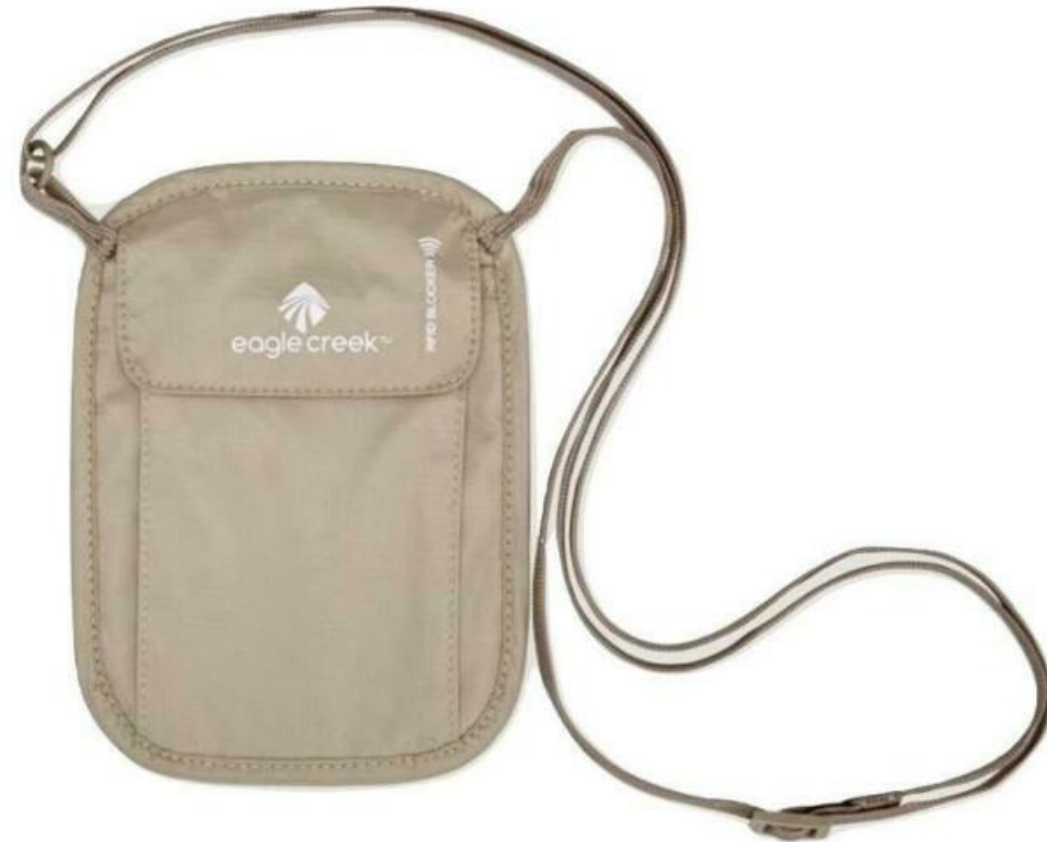
Eagle Creek RFID Blocker Neck Wallet