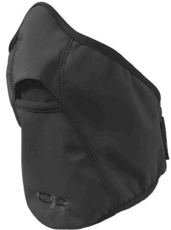
Outdoor Research Face Mask