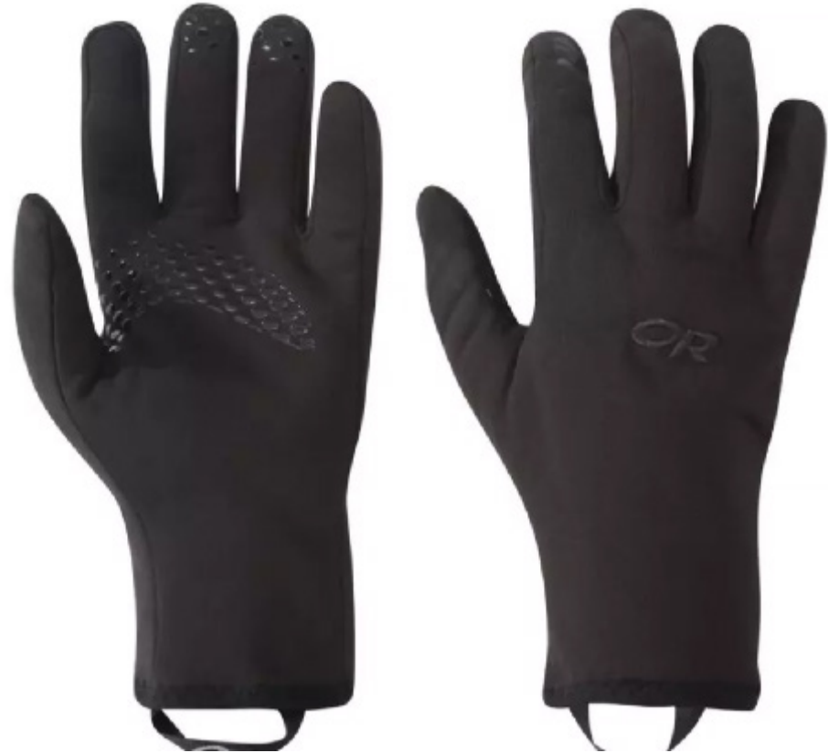
Outdoor Research Waterproof Liners