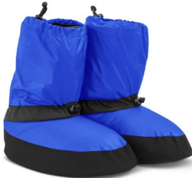
Feathered Friends Down Booties