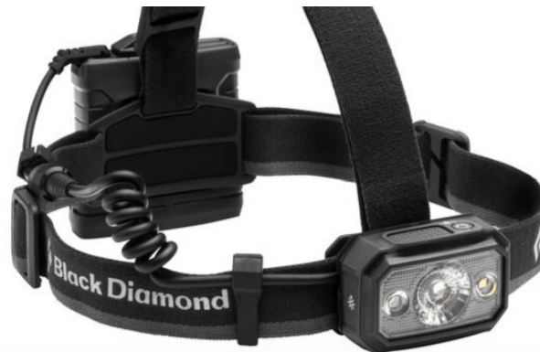
Black Diamond Icon 700