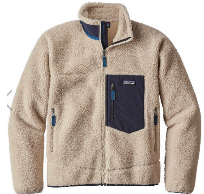
Patagonia Classic Retro-X Jacket