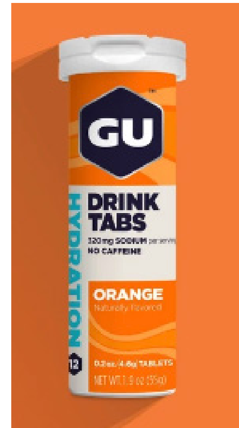
Gu Hydration Tabs