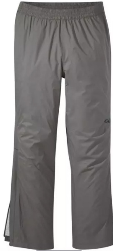
Outdoor Research Men's Apollo Rain Pant