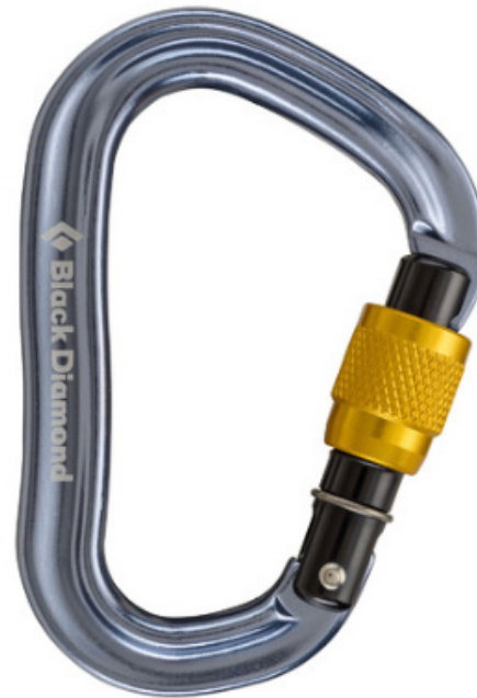
Black Diamond VaporLock Screwgate Carabiner