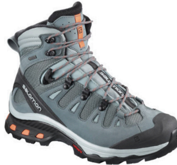
Salomon Women's Quest 4D 3 Gore-Tex® Boots