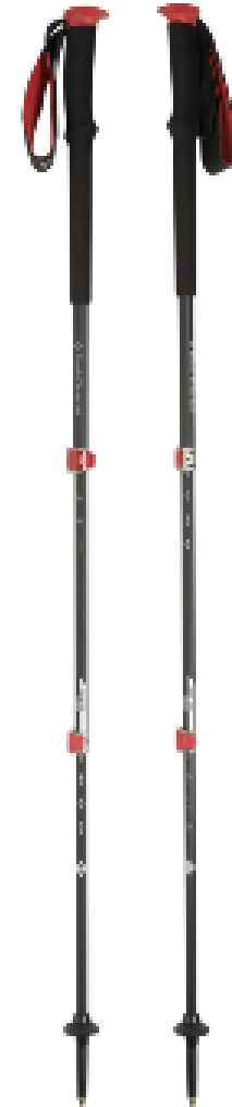
Black Diamond Trail Pro