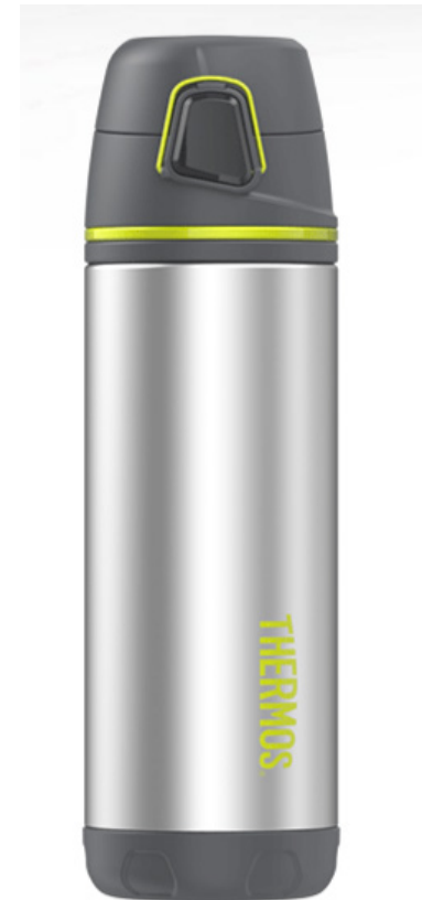
Thermos 470ml E5