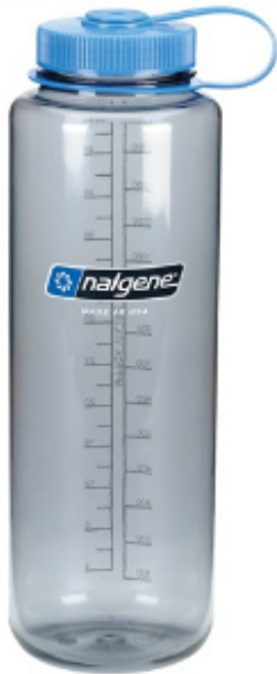
Nalgene 48 oz wide mouth Silo