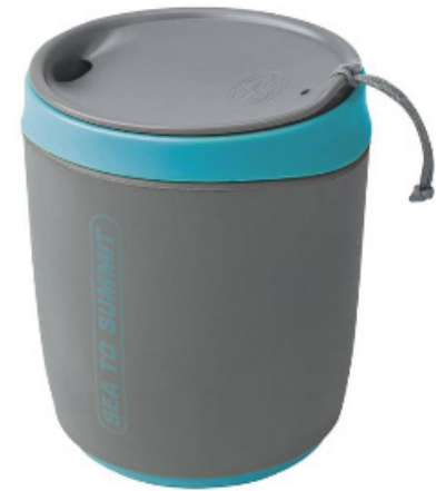
Sea to Summit Delta Insulmug