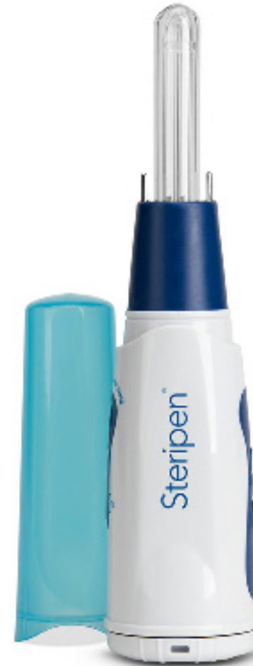
Katadyn Steripen Classic 3