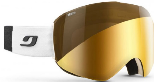
Julbo Skydome Reactive 2-4