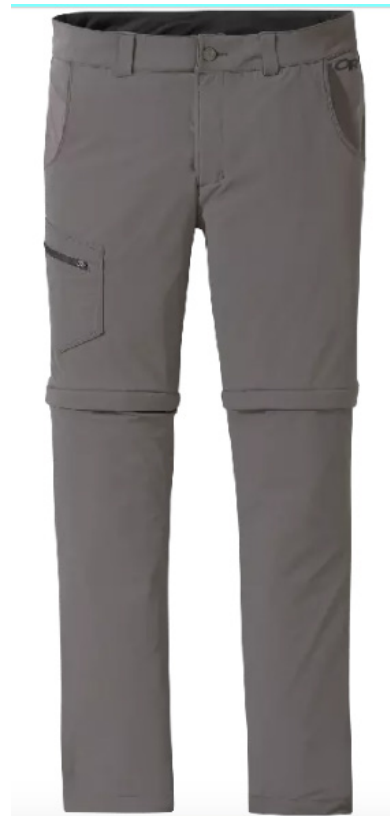
Outdoor Research Men's Ferrosi Convertible Pants