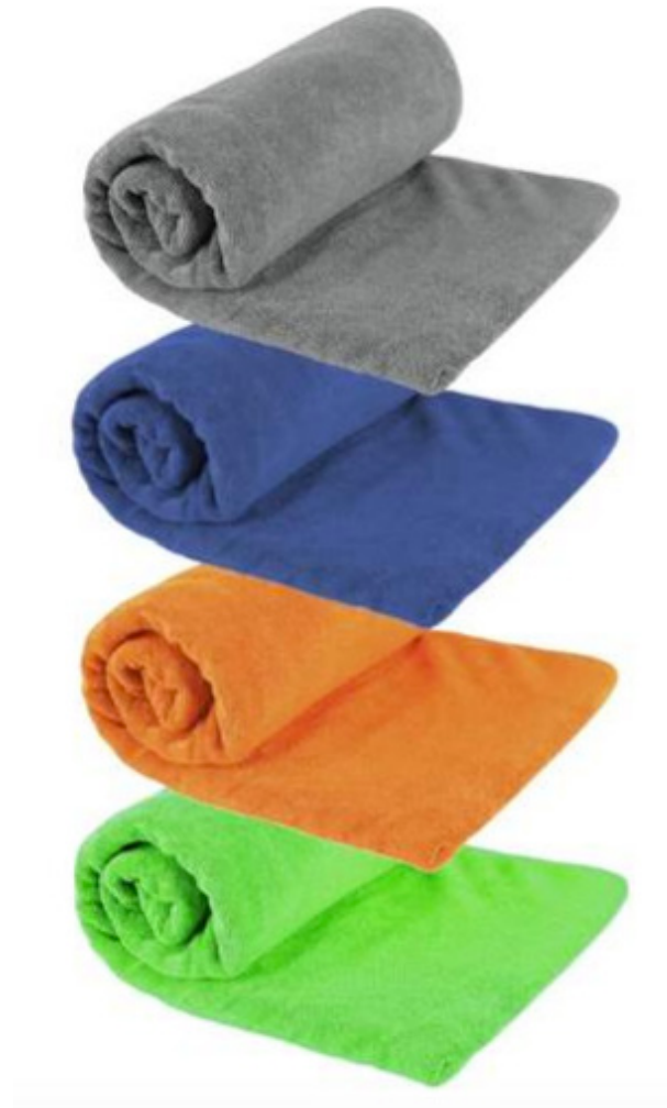
Sea to Summit Tek Towel