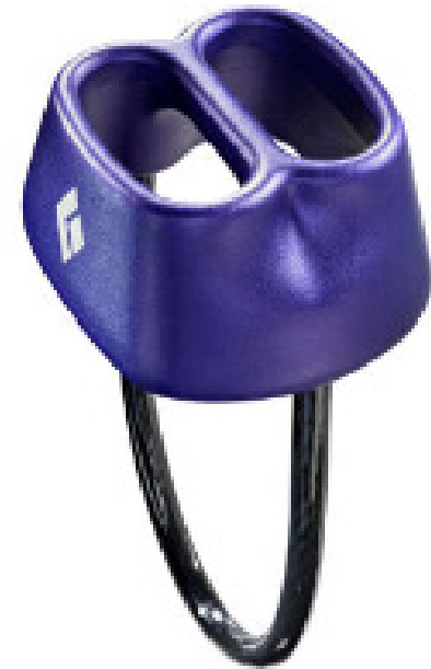
Black Diamond Super 8 AND Black Diamond ATC