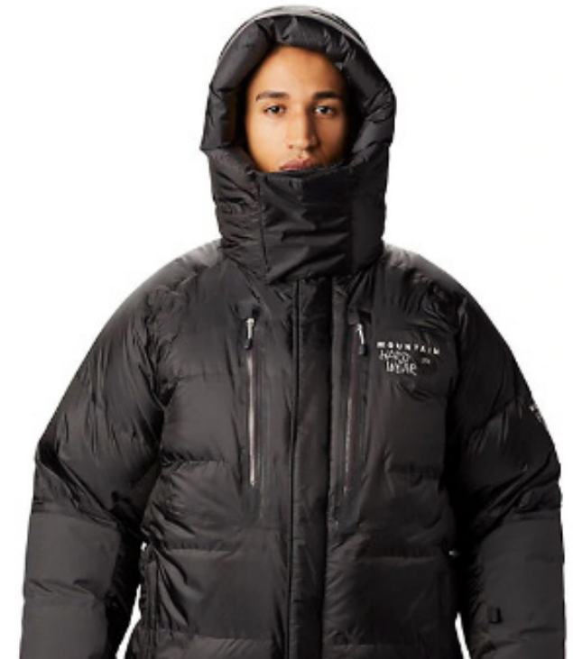
Mountain Hardware Absolute Zero Parka