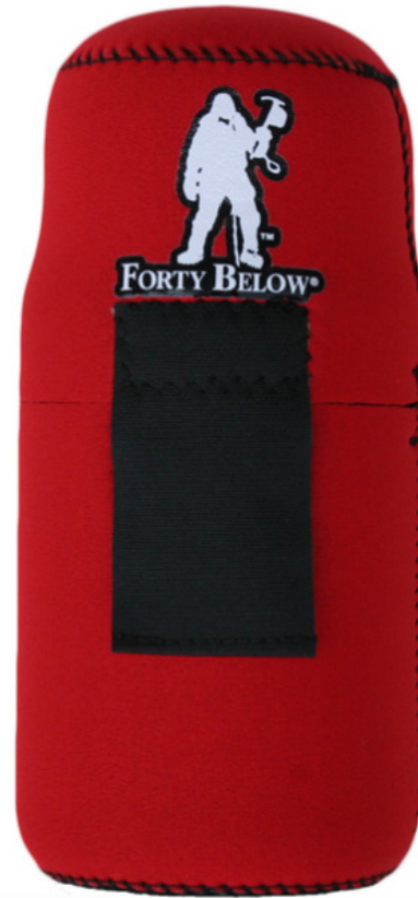
Forty Below Bottle Boot