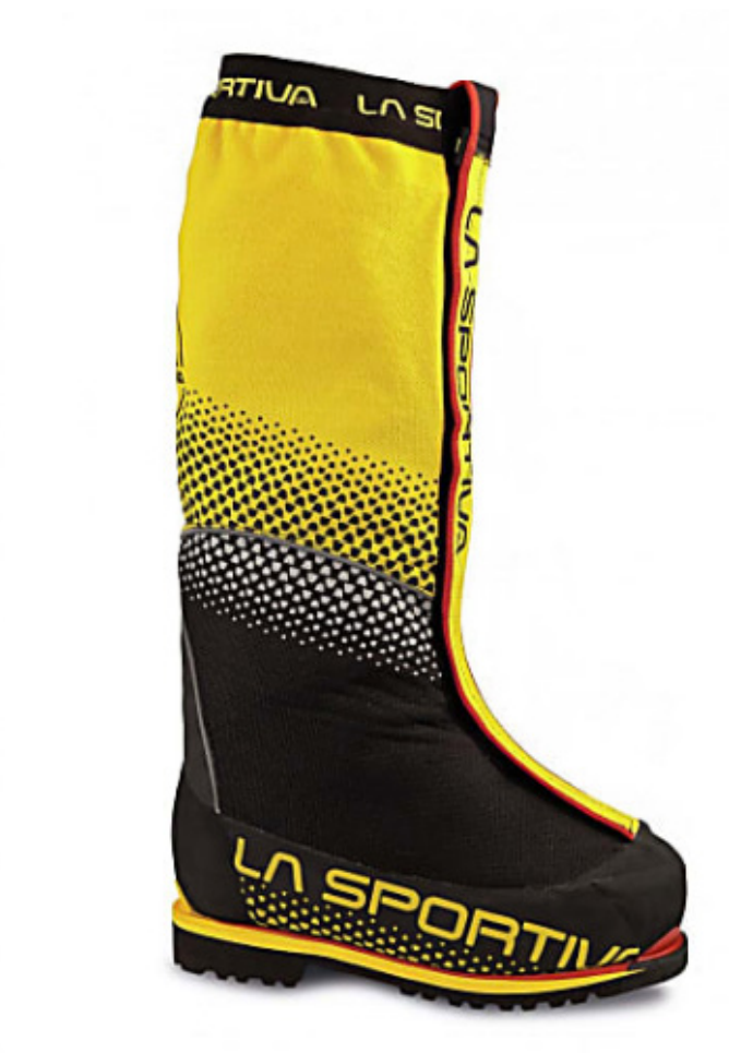
LaSportiva Olympus Mons