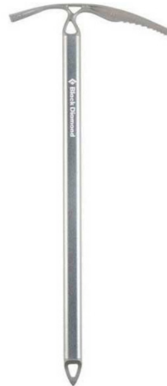
Black Diamond Raven Ice Axe