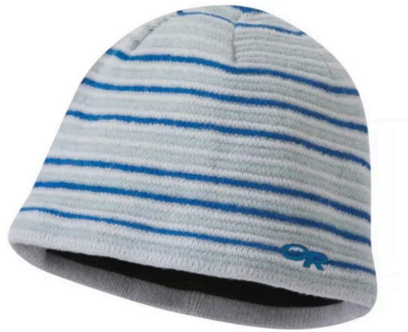
Outdoor Research Spitsbergen Hat