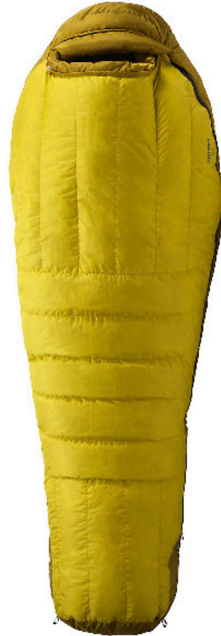
Marmot Col (-20F)