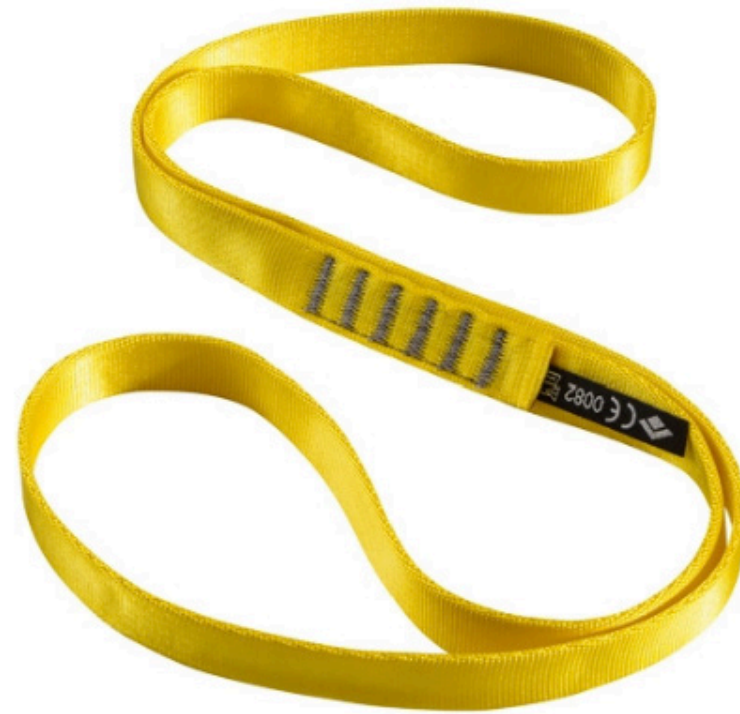
Black Diamond Nylon Slings