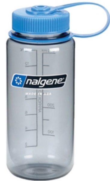
Nalgene 16oz wide mouth