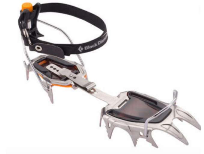
Black Diamond 12 point Sabretooth Crampon