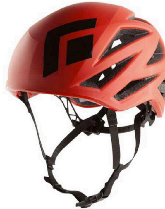
Black Diamond Vapor Helmet