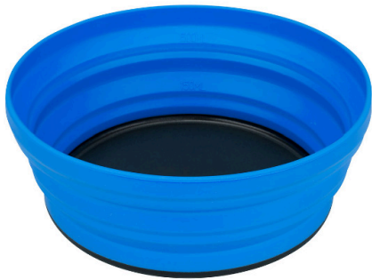
Sea to Summit X-Bowl