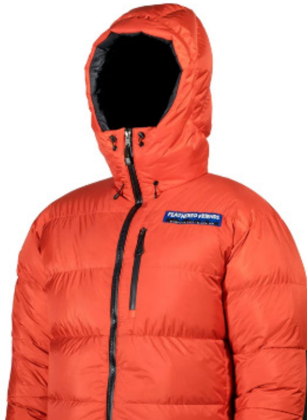
Feathered Friends Khumbu Parka