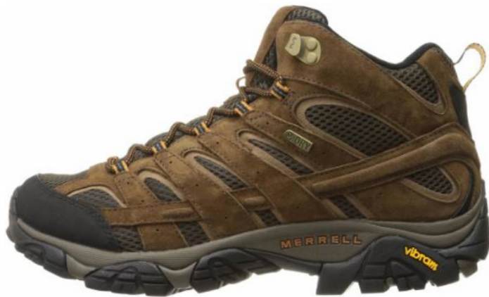
Merrell Moab 2 Mid Waterproof