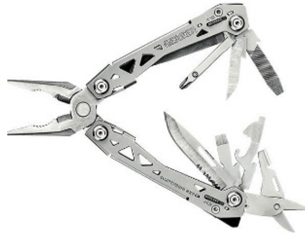
Gerber Suspension NXT Multi-Tool