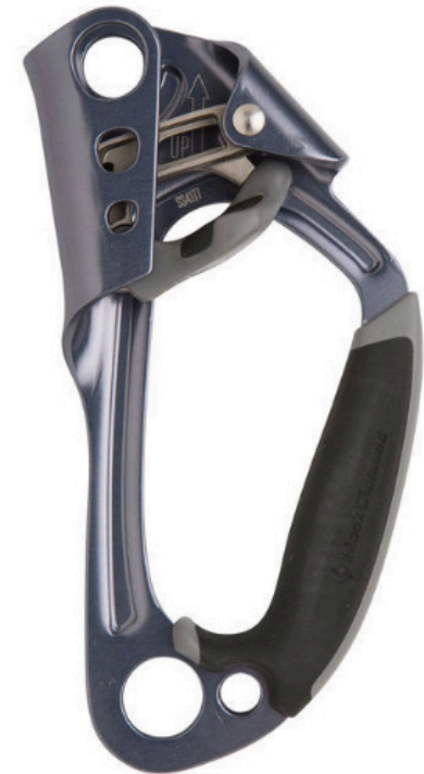
Black Diamond Index Ascender