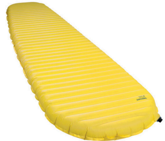
Thermarest Neoair XLite