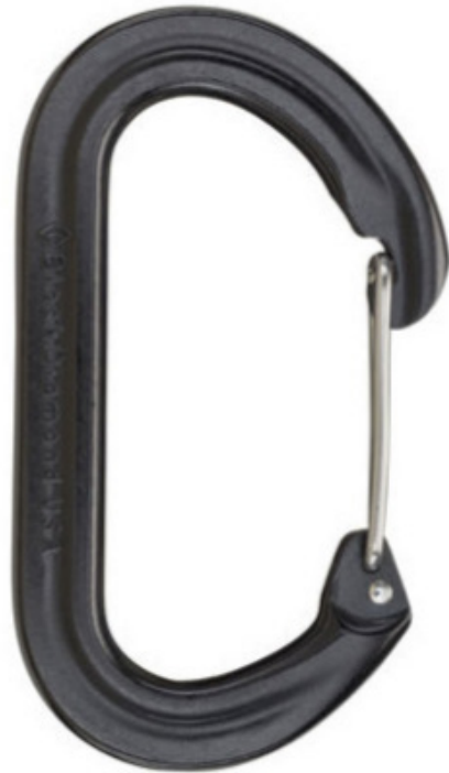
Black Diamond Oval Wire Carabiner

3 locking carabiners and 4 non-locking carabiners