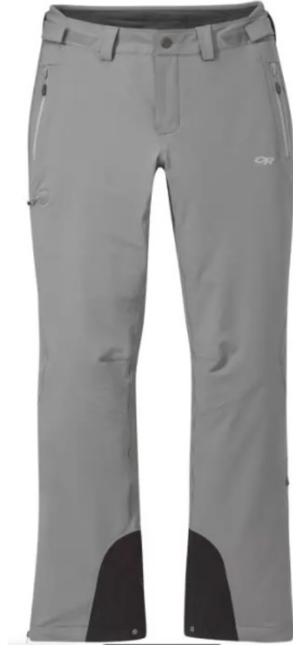
Outdoor Research Women's Cirque II Pants