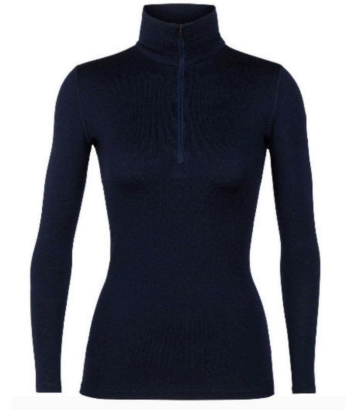
Women's 260 Tech Long Sleeve Half Zip