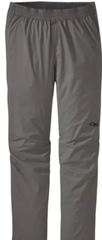
Outdoor Research Women's Apollo Rain Pants