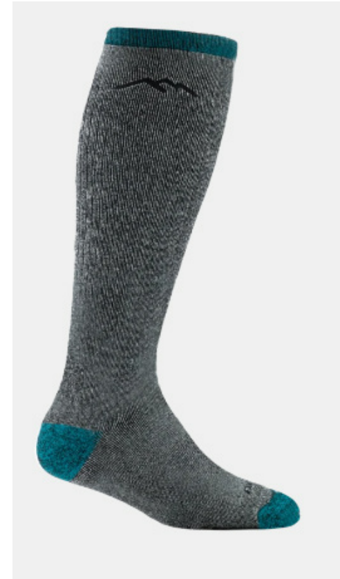
Darn Tough Mountaineering Over-the-calf Extra Cushion