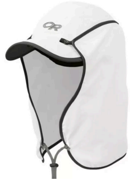
Outdoor Research Sun-Runner Cap