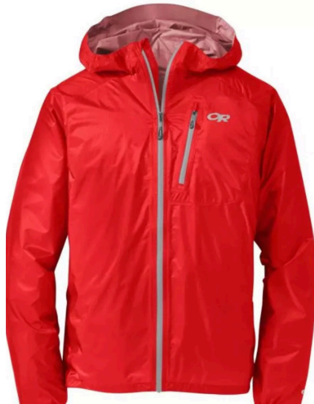
Outdoor Research Men's Helium II Jacket