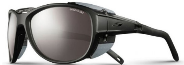
Julbo Explorer 2.0 Spectron 4