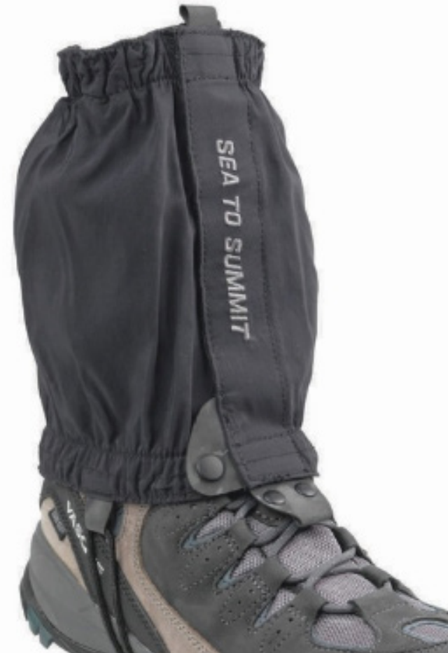
Sea To Summit Tumbleweed Ankle Gaiters