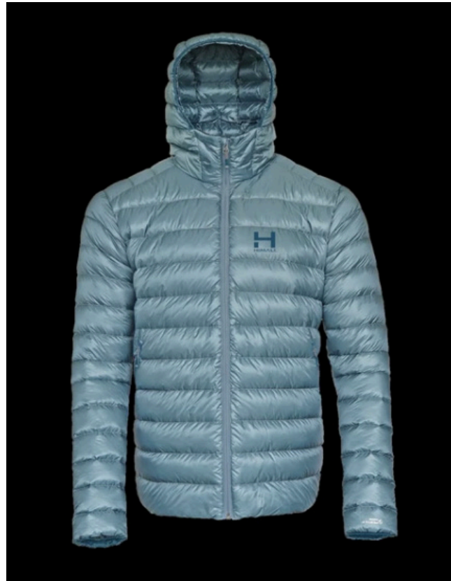
Himali Altocumulus Down Jacket 2.0