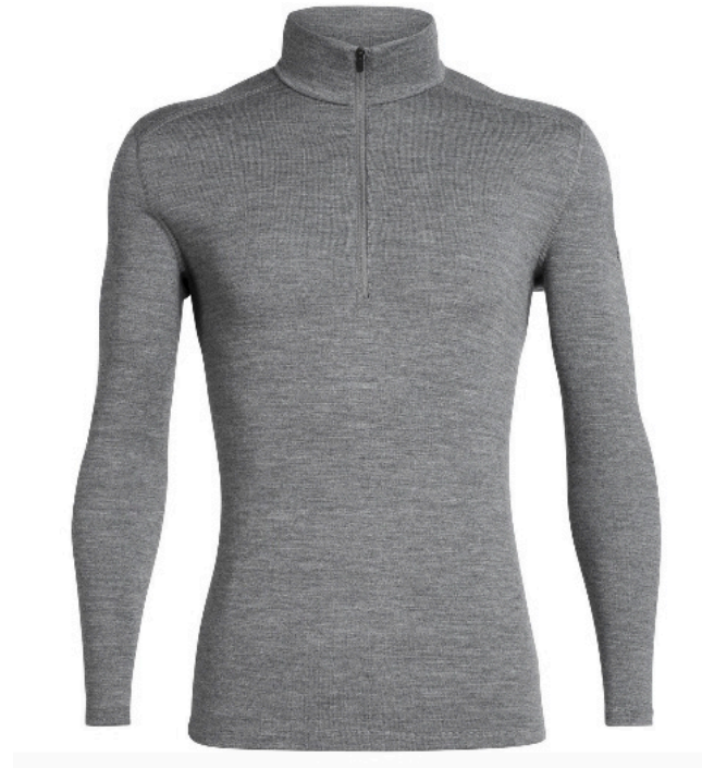
Men's Merino 260 Tech Long Sleeve Half Zip Thermal Base Layer Top