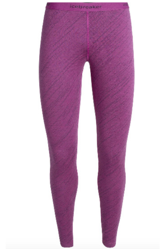
Women's 250 Vertex Leggings Snow Storm