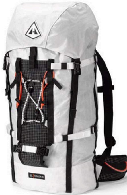
Hyperlite Mountain Gear Halka 55