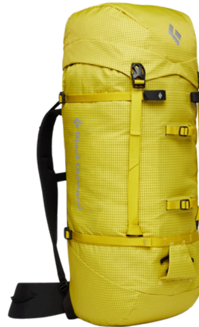
Black Diamond Speed Goat 40