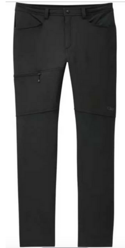
Outdoor Research Women's Apollo Rain Pants