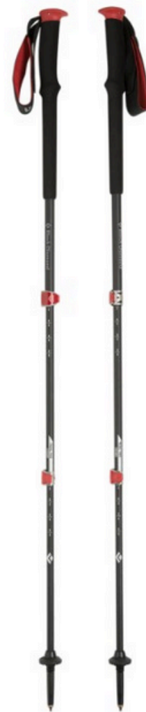
Black Diamond Trail Pro