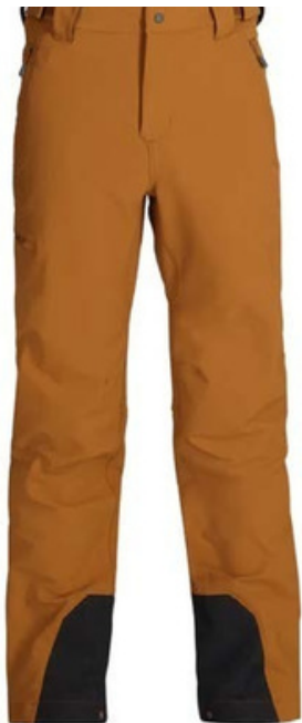
Outdoor Research Men's Research Cirque II Pants