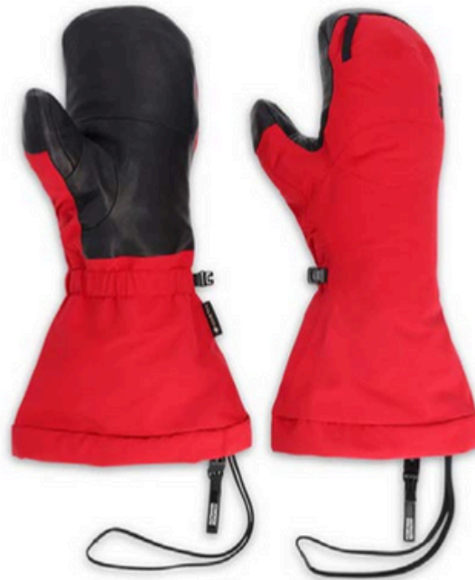
Outdoor Research Men's Alti II GORE-TEX Mitts