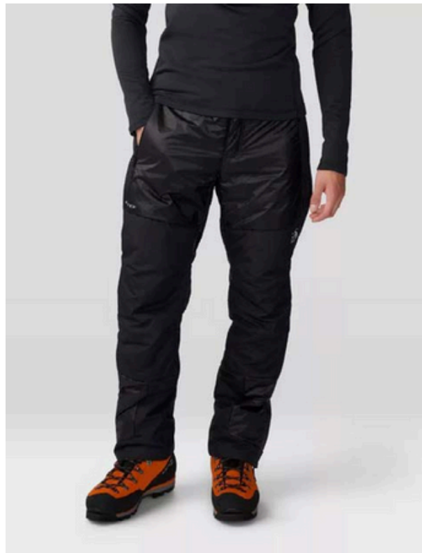
Mountain Hardwear Men's Compressor Alpine Pant