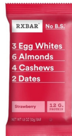
RXBARS Protein Bars