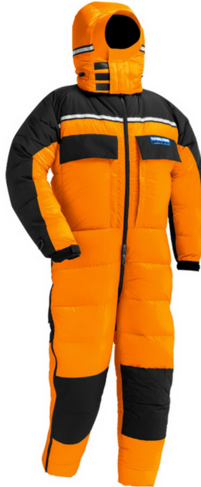
Feathered Friends Expedition Down Suit