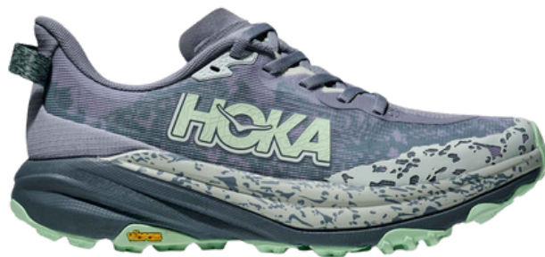
Hoka Speedgoat 6