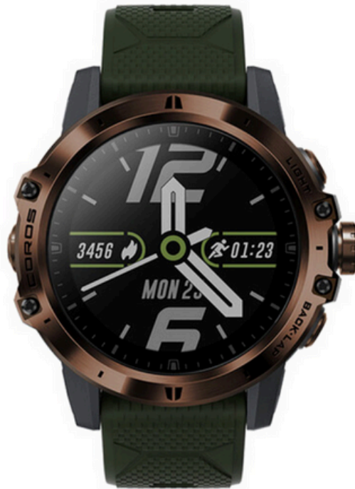
Coros Vertic GPS Watch