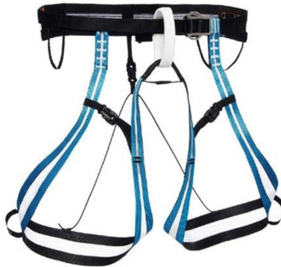
Black Diamond Couloir Harness