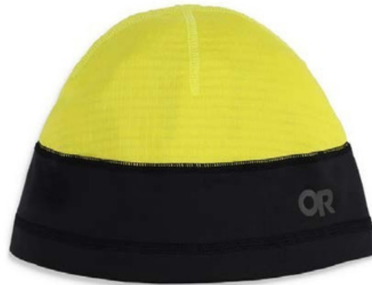
Outdoor Research Vigor Grid Fleece Beanie