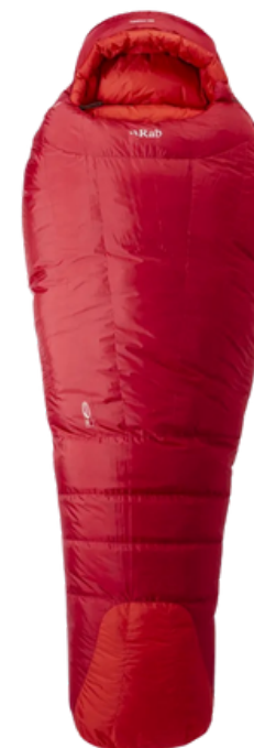
RAB Expedition 1400 Sleeping Bag -40°F