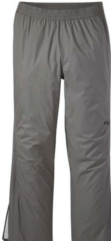
Outdoor Research Men's Apollo Rain Pants