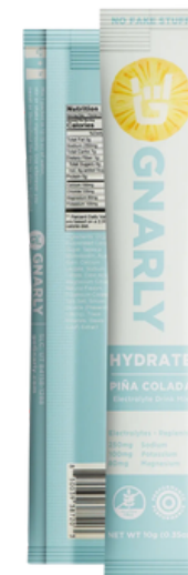
Gnarly Hydrate Electrolyte Drink Mix