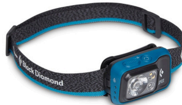
Black Diamond Spot 400 Headlamp