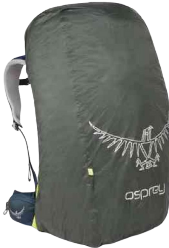
Osprey Ultralight Rain Cover