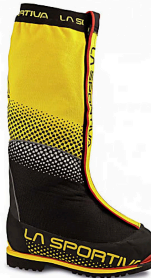
La Sportiva Olympus Mons Cube S