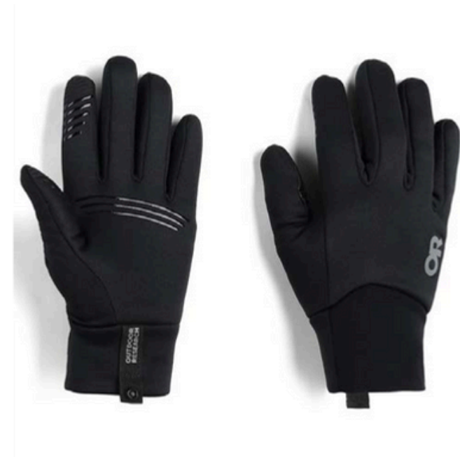
Outdoor Research Women's Vigor Midweight Sensor Gloves