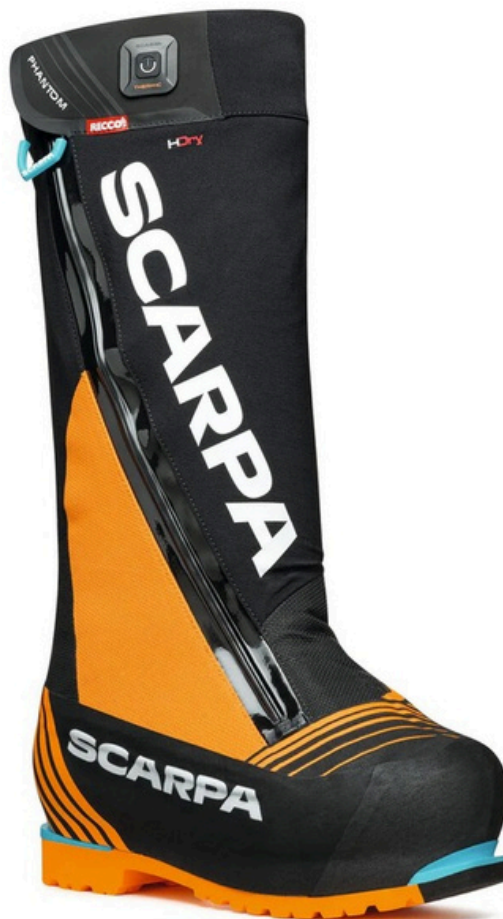
Scarpa Phantom 8,000 Thermic HD