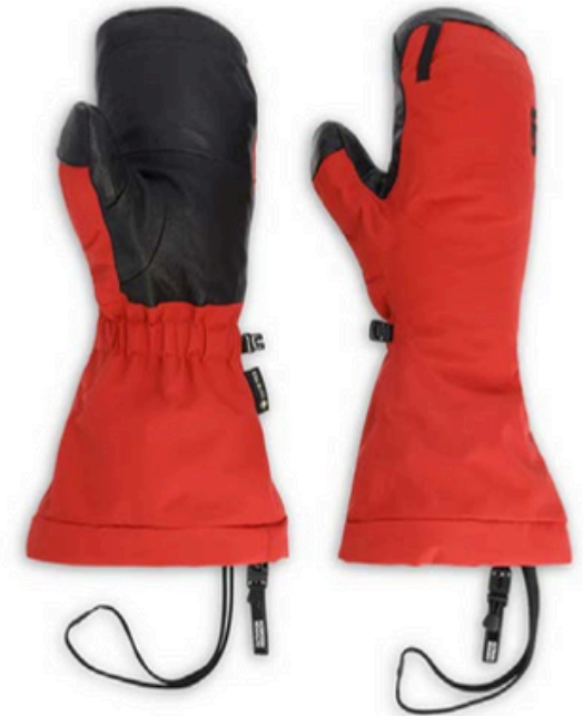
Outdoor Research Women's Alti II GORE-TEX Mitts