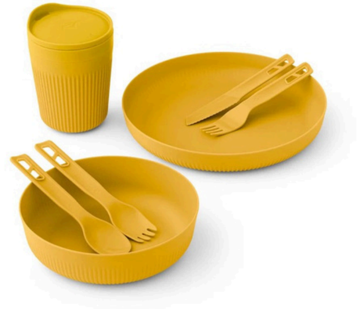
Sea to Summit Passage Dinnerware Set