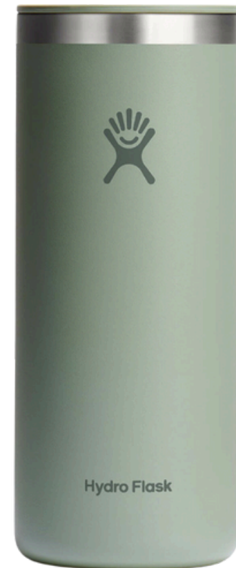
Hydroflask 20 oz Coffee Mug