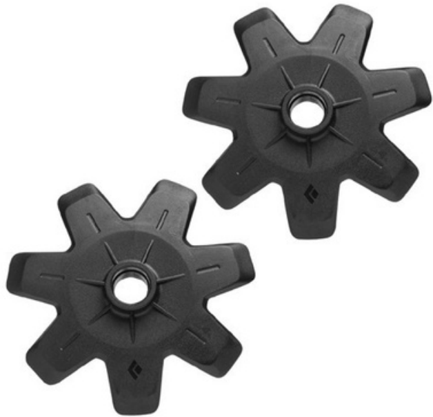
Black Diamond Powder Baskets