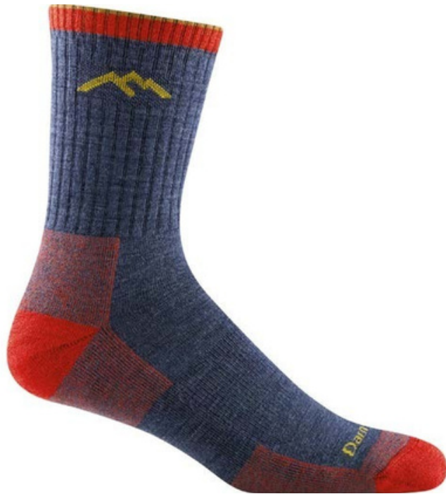
Darn Tough Men's Hiker Micro Crew Midweight Hiking Sock