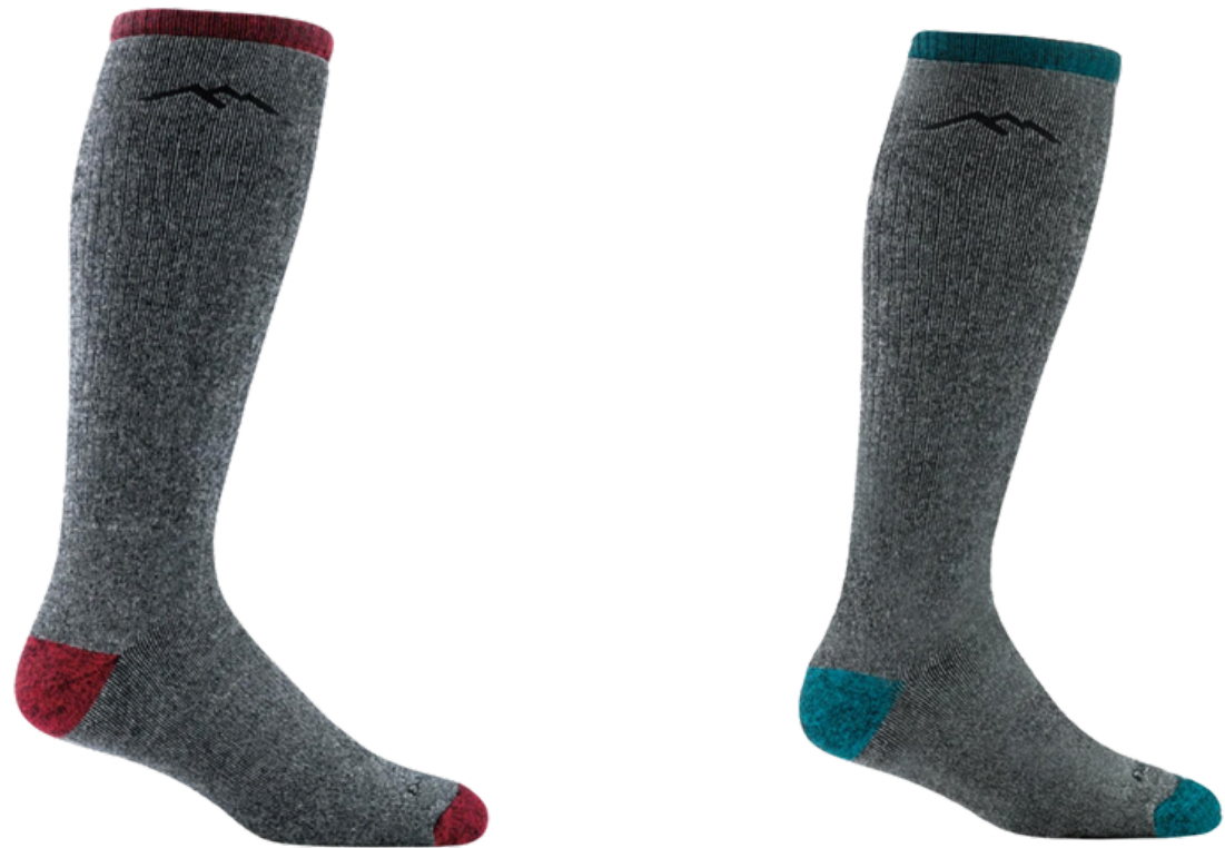
Darn Tough Mountaineering Over-the-Calf Extra Cushion