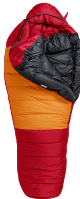
Feathered Friends Snow Goose ES -40°F