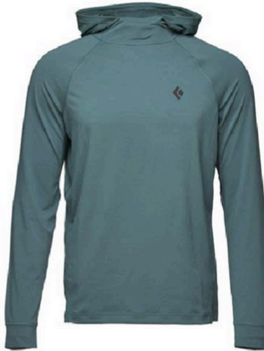
Black Diamond Men's Alpenglowl Hoody