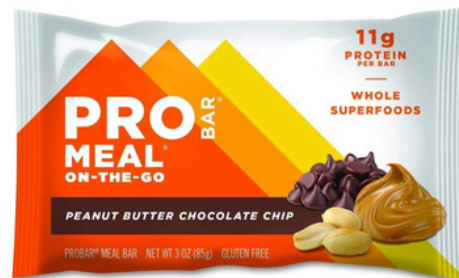
Pro Bar Meal Bars