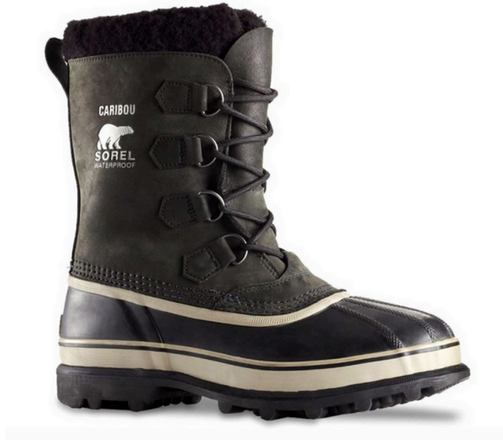
Sorel Caribou Boot