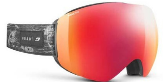
Julbo Skydome REACTIV 2-4