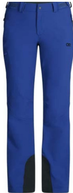
Outdoor Research Women's Cirque II Pants