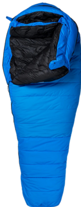
Feathered Friends Plover ES -25°F Women's Sleeping Bag