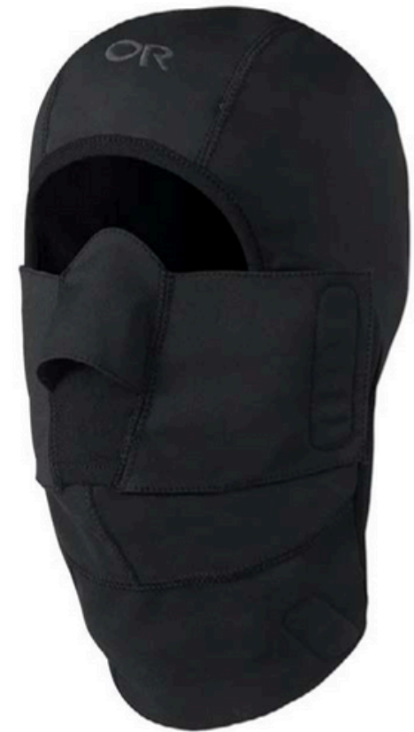
Outdoor Research Gorilla Gore-Tex® Infinium™ Balaclava