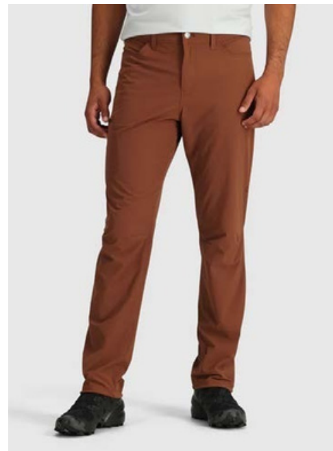
Outdoor Research Men's Ferrosi Pants