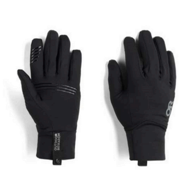
Outdoor Research Men's Vigor Midweight Sensor Gloves