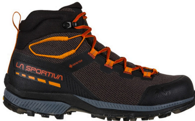
La Sportiva TX Hike Mid GTX