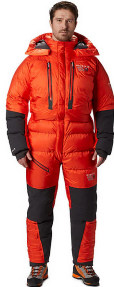
Mountain Hardware Absolute Zero Suit