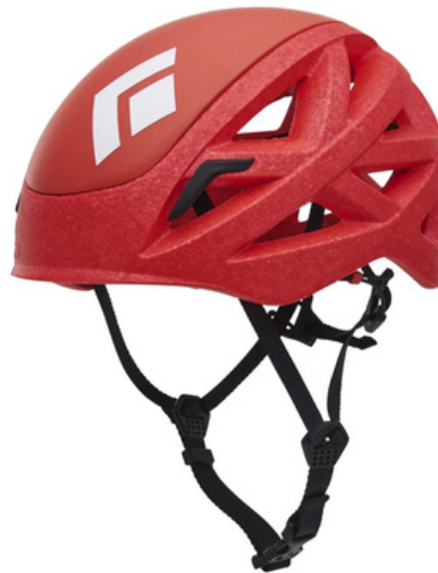
Black Diamond Vapor Helmet