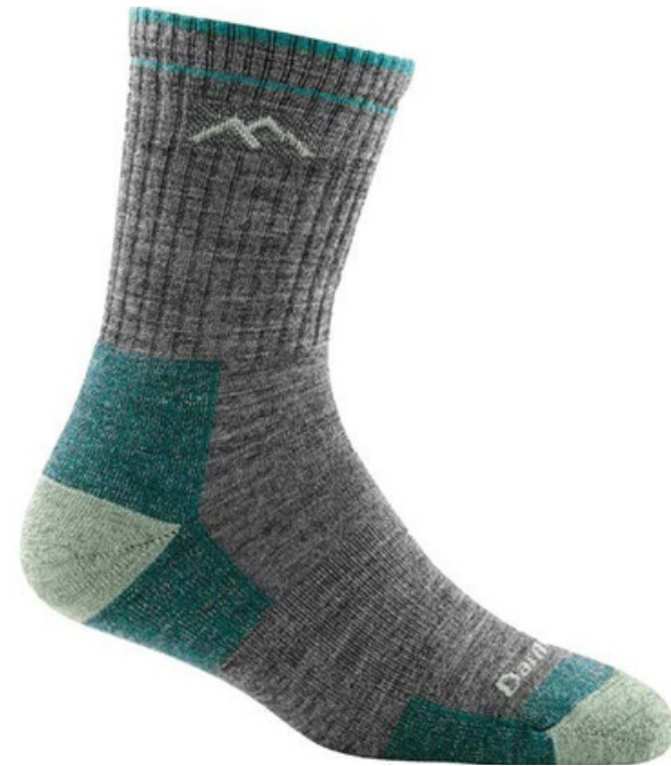
Darn Tough Women's Hiker Micro Crew Midweight Hiking Sock