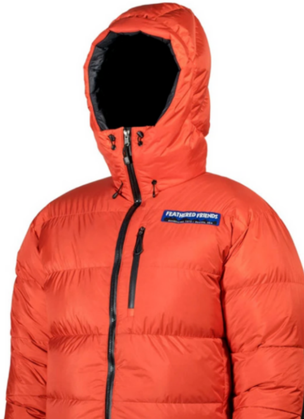
Feathered Friends Khumbu Parka