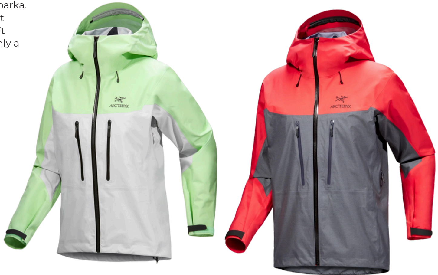
Arc'teryx Alpha Jacket Men's and Women's