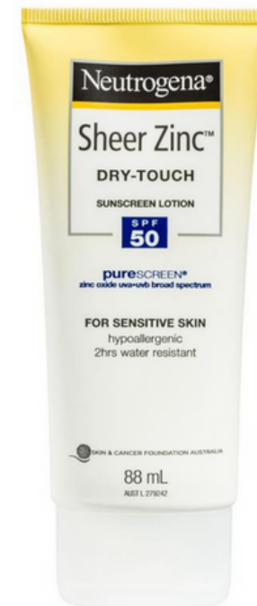
Neutrogena Sheer Zinc