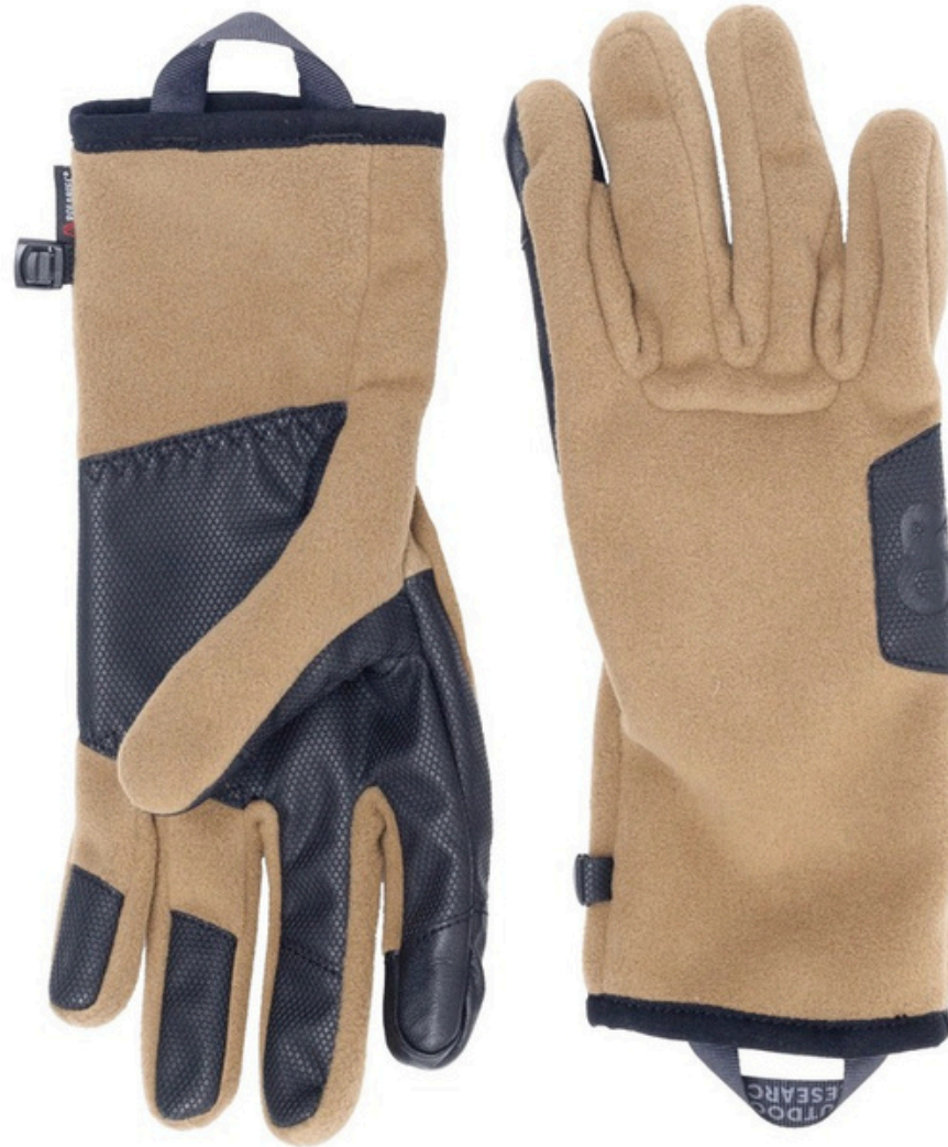
Outdoor Research Storm Tracker Sensor Windbloc Gloves