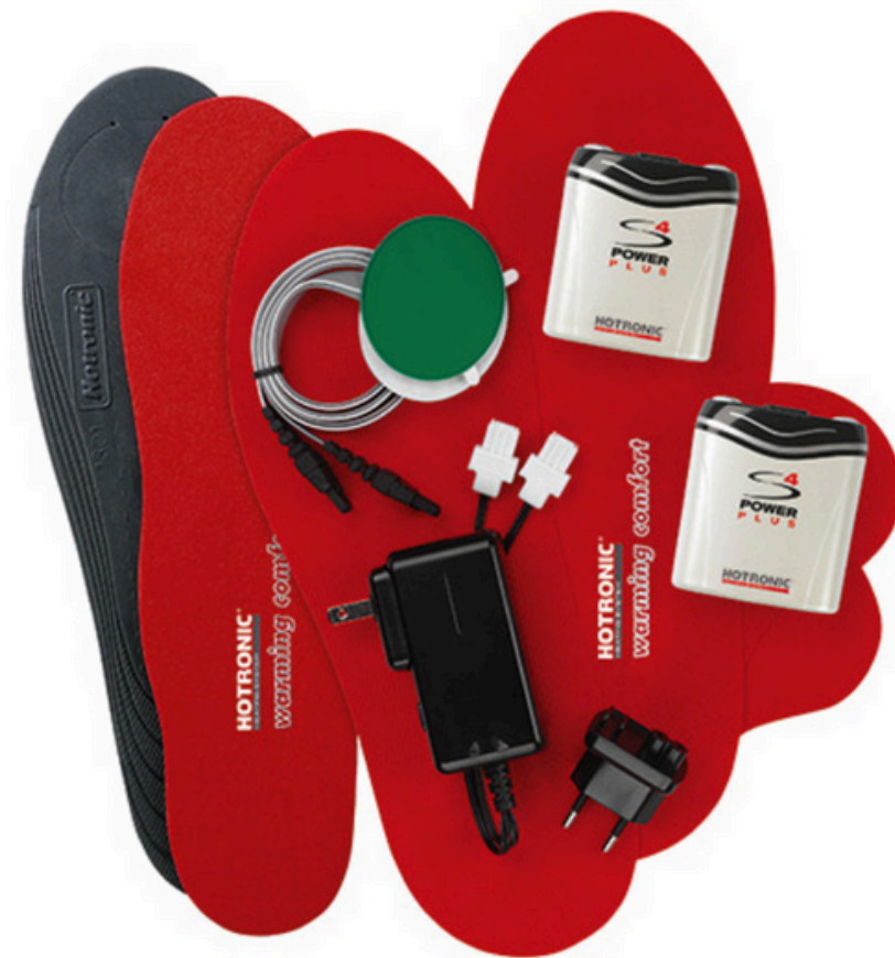
Hotronics Foot Warmer Power Plus Universal

Note: these are built into the Scarpa Phantom 8,000 Thermic HD boots.