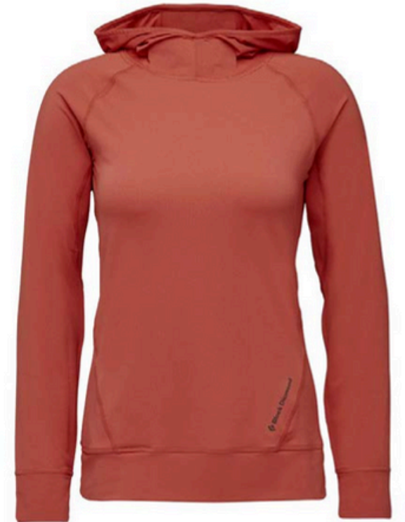
Black Diamond Women's Alpenglowl Hoody