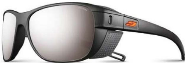
Julbo Camino with Spectron 4 Lens