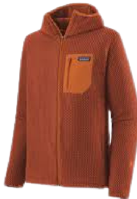
Patagonia R1 Air Full-Zip Hoody Men's or Women's