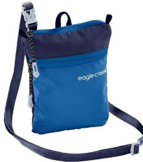
Eagle Creek Stash Neck Pouch