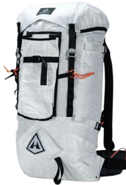
Hyperlite Prism Pack (40L)