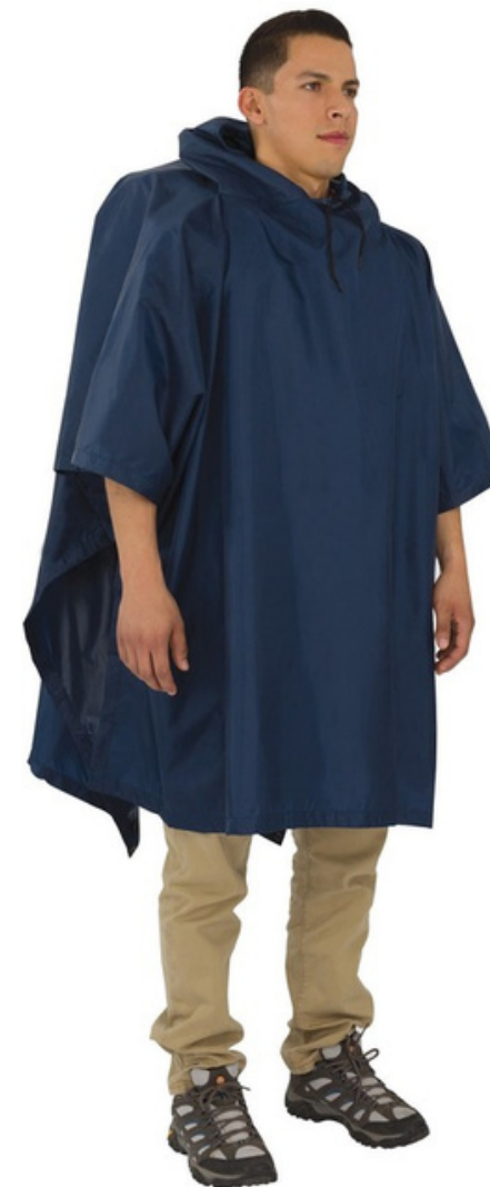
Outdoor Products Backpacker Poncho