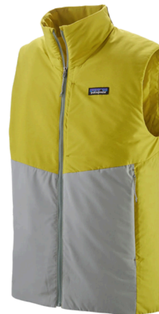
Patagonia Nano-Air Light Vest Men's or Women's