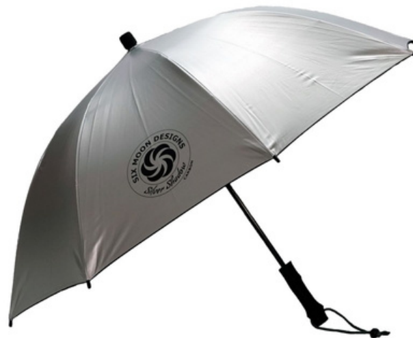
Six Moon Designs Silver Shadow Ultralight Umbrella