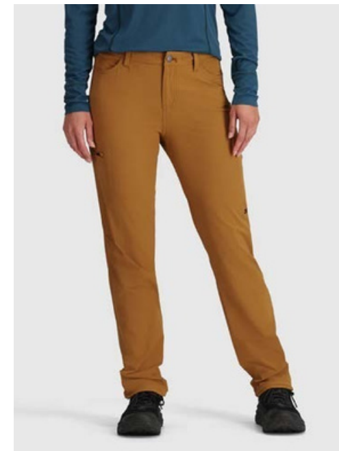
Outdoor Research Women's Ferrosi Pants