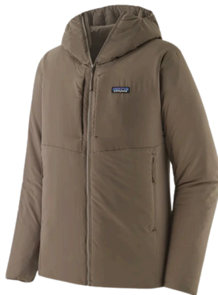
Patagonia Nano-Air Hoody Men's or Women's