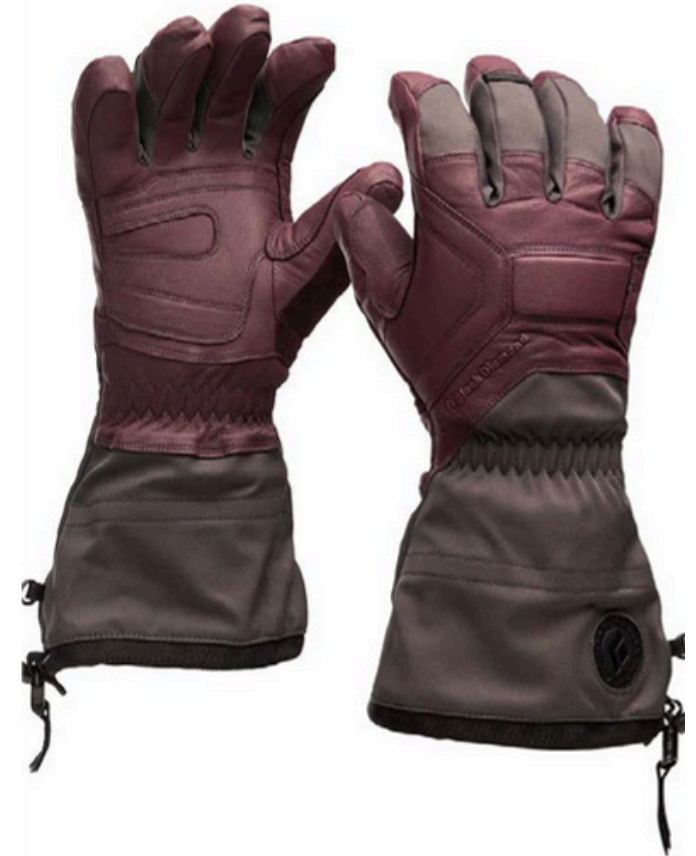
Black Diamond Women's Guide Gloves