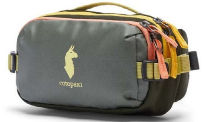
Cotopaxi Allpa X 1.5L Hip Pack