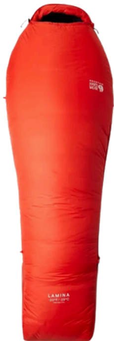
Mountain Hardwear Lamina -20°F/-29°C