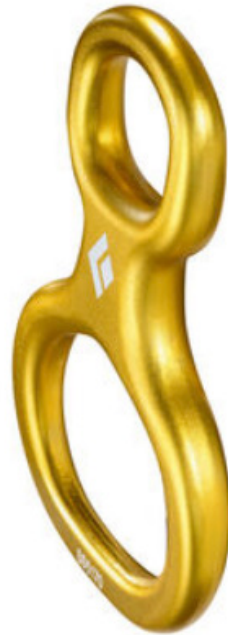
Black Diamond Super 8