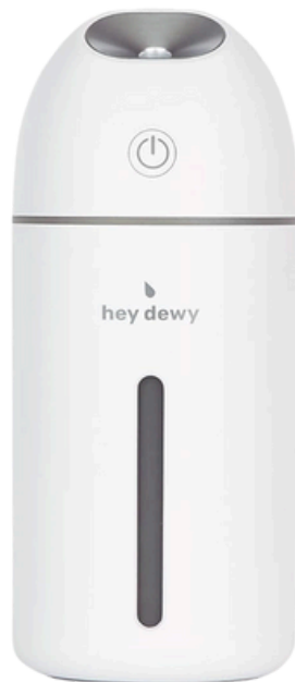
Hey Dewy Wireless, Rechargeable Humidifier.