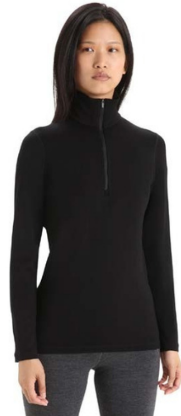
Icebreaker Women's Merino 260 Tech Long Sleeve Half Zip Thermal Top