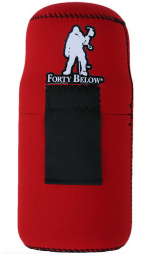
Forty Below Bottle Boot