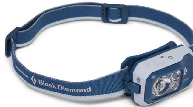
Black Diamond Storm 450 Headlamp