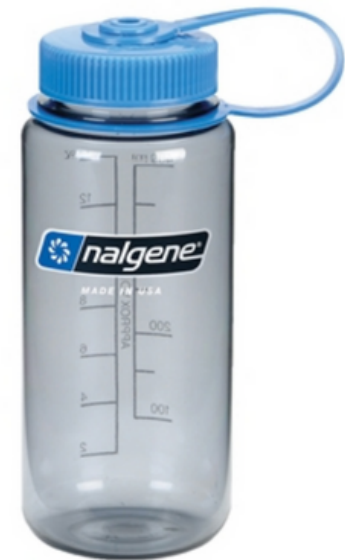
Nalgene 16oz wide mouth