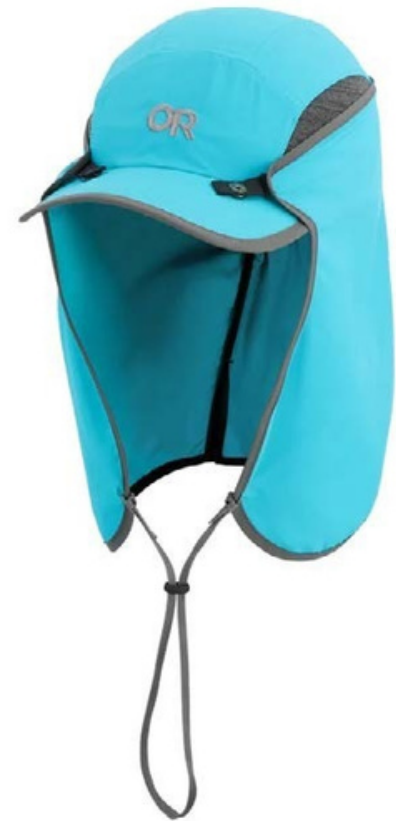
Outdoor Research Sun Runner Cap