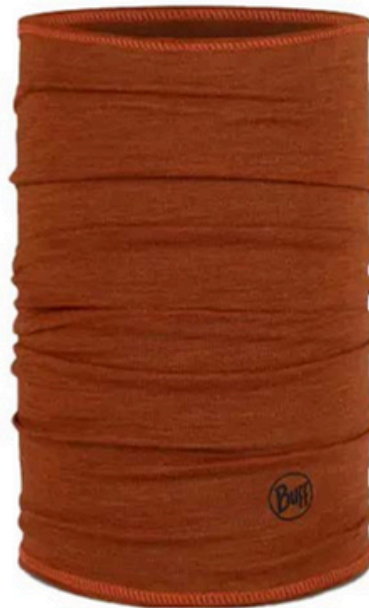
Buff Lightweight Merino Neck Gaiter