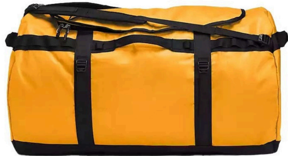
The North Face XXL Base Camp Duffel (150L)