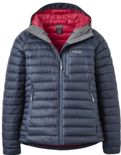
RAB Microlight Alpine Down Jacket - Men's or Women's