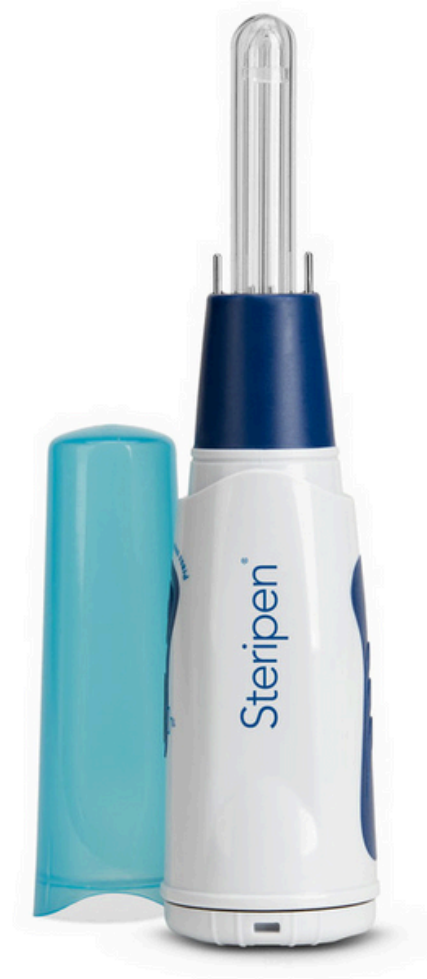
Katadyn Steripen Adventurer Opti UV Water Purifier