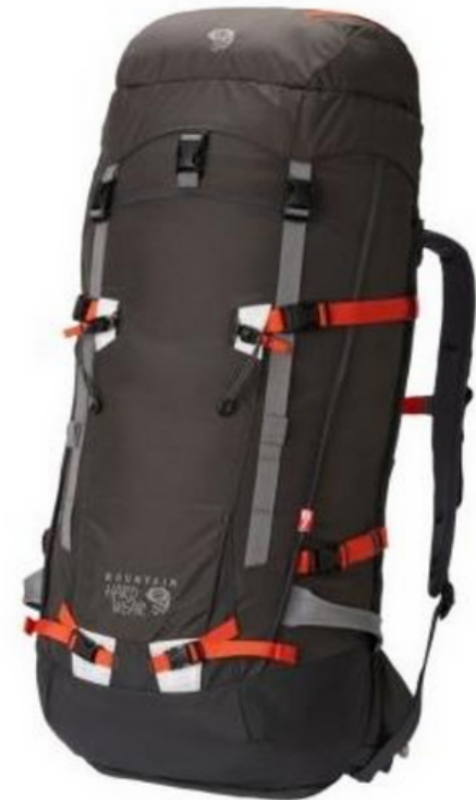
Mountain Hardwear Direttissima 50L