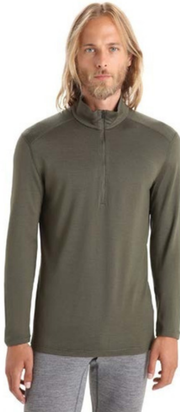
Icebreaker Men's Merino 260 Tech Long Sleeve Half Zip Thermal Top