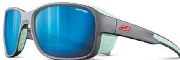
Julbo Monterosa 2