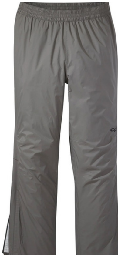
Outdoor Research Men's Apollo Rain Pants