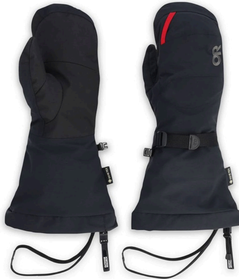
Outdoor Research Mt. Baker II Gore-Tex Mitts