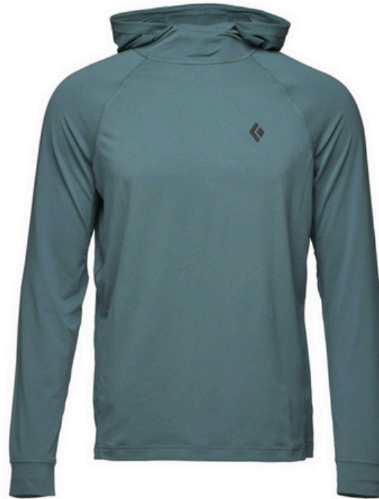
Black Diamond Men's Alpenglowl Hoody