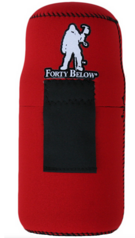
Forty Below® Bottle Boot™