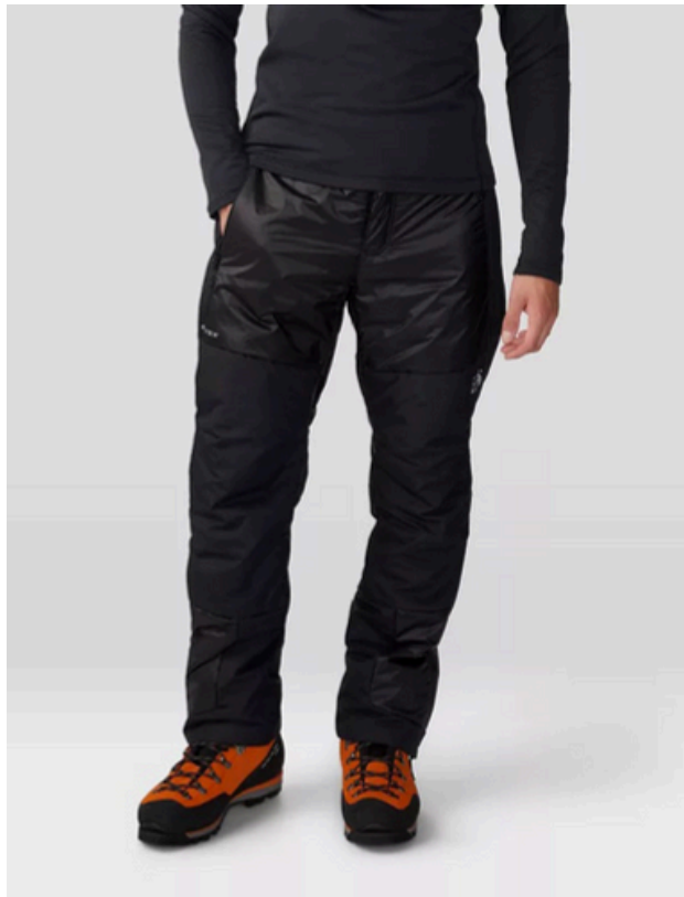
Mountain Hardwear Men's Compressor Alpine Pant