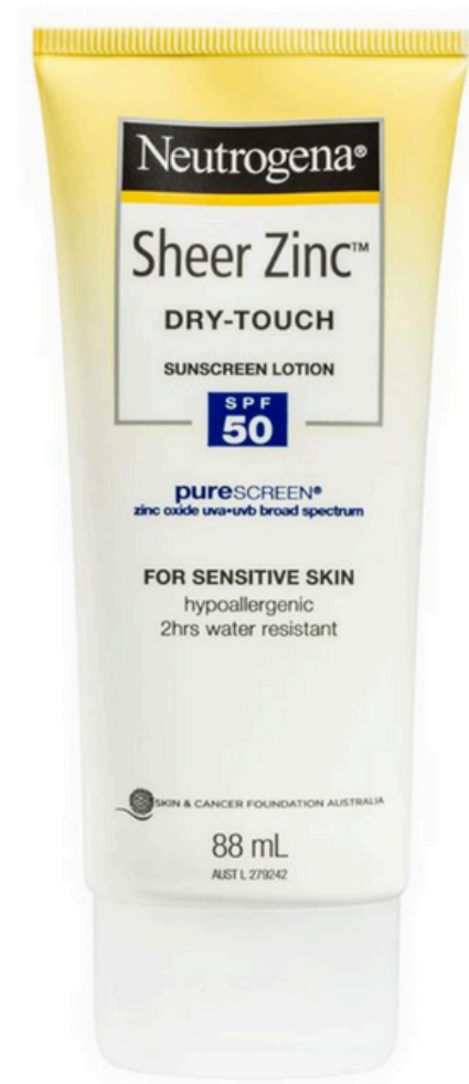
Neutrogena Sheer Zinc