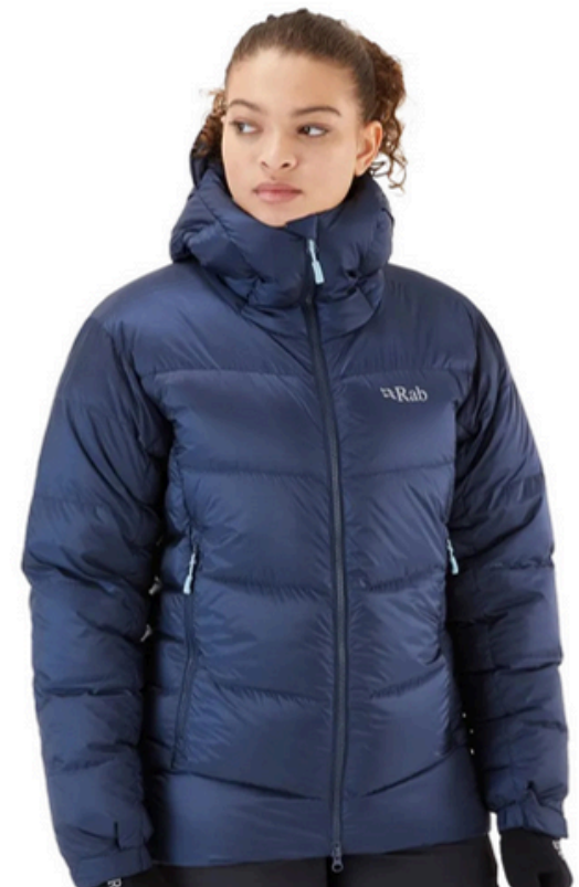
RAB Women's Positron Pro Down Jacket