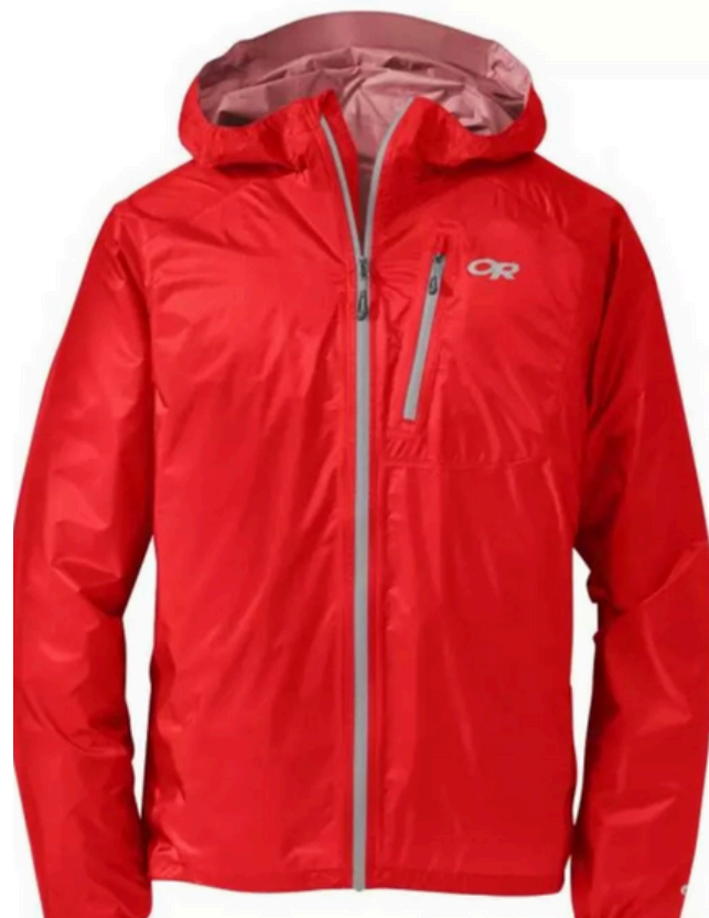
Outdoor Research Men's Helium II Jacket