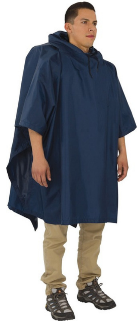
Outdoor Products Backpacker Poncho