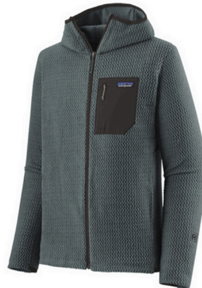
Patagonia Men's R1 Air Full-Zip Hoody