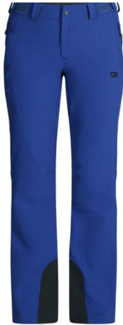
Outdoor Research Women's Cirque II Pants