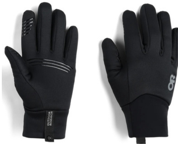
Outdoor Research Men's Vigor Midweight Sensor Gloves