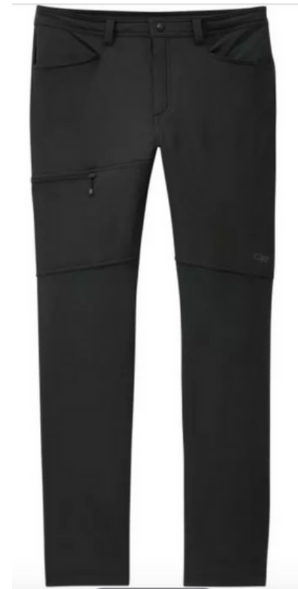
Outdoor Research Women's Apollo Rain Pants