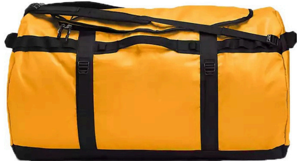
The North Face Base Camp Duffel - XXL