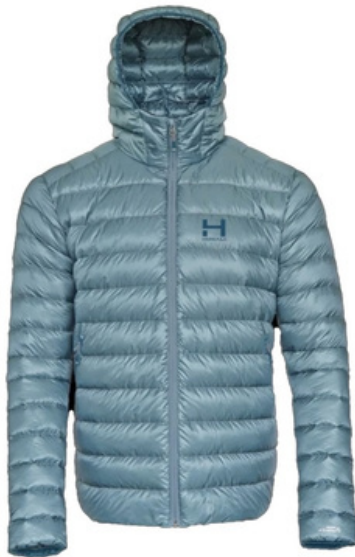
Himali Accelerator Down Jacket 2.0