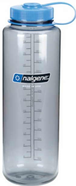
Nalgene 48oz wide mouth Silo