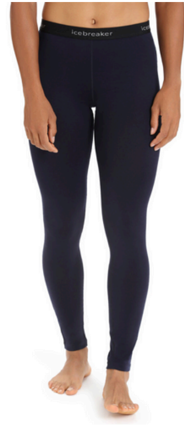
Icebreaker Women's Merino 260 Tech Thermal Leggings