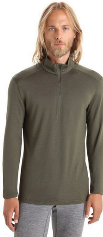
Icebreaker Men's Merino 260 Tech Long Sleeve Half Zip Thermal Top