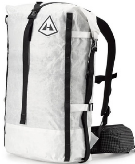
Hyperlite Mountain Gear Porter Pack (40L)