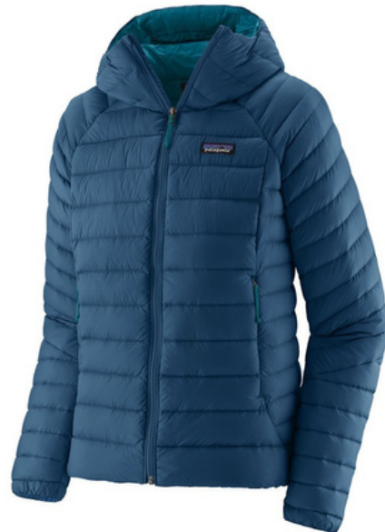
Patagonia Women's Down Sweater Hoody