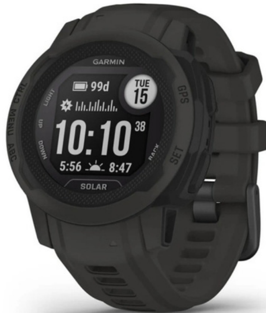
Garmin Instinct 2S Solar