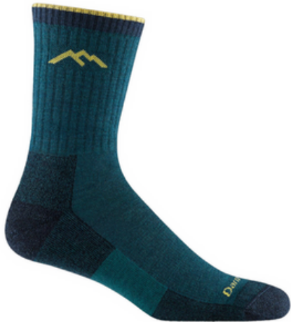
Darn Tough Men's Hiker Micro Crew Midweight Hiking Sock