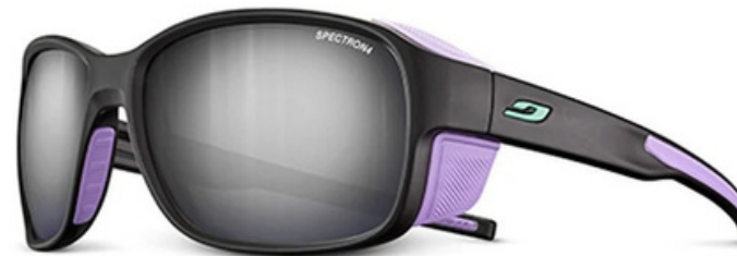
Julbo Monterosa 2