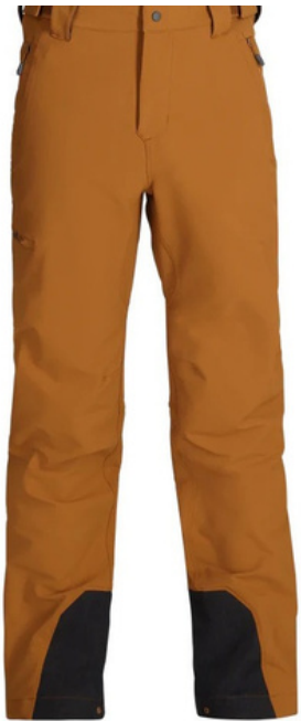
Outdoor Research Men's Research Cirque II Pants