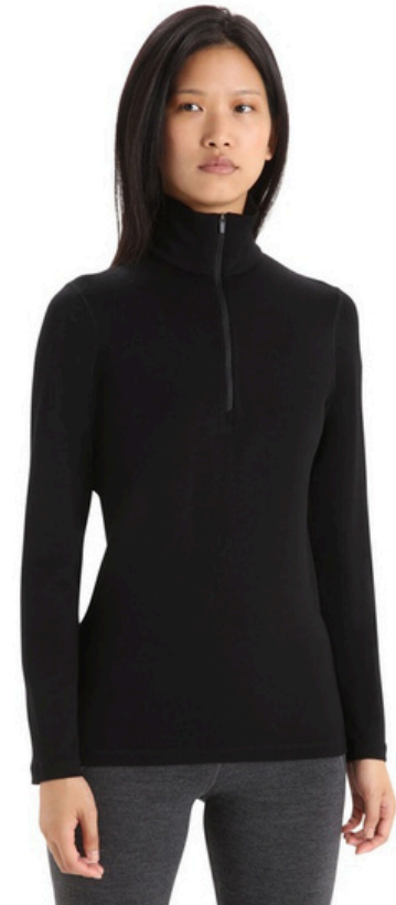
Icebreaker Women's Merino 260 Tech Long Sleeve Half Zip Thermal Top