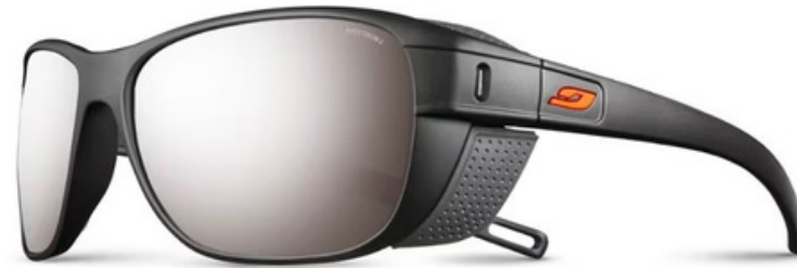
Julbo Camino with Spectron 4 Lens