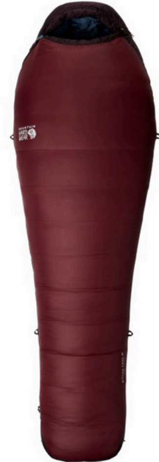
Mountain Hardwear Women's Bishop Pass 0°F/-18°C