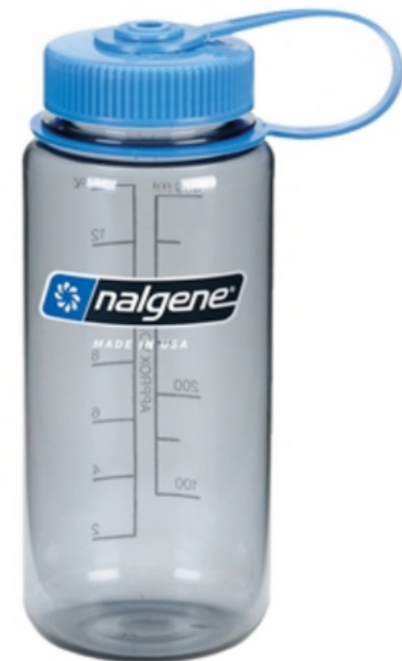
Nalgene 16oz wide mouth