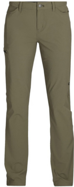
Outdoor Research Women's Ferrosi Pants