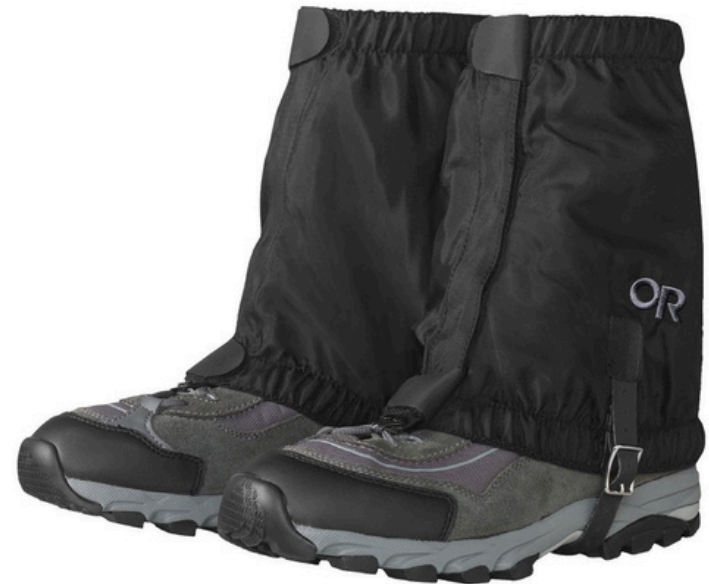
Outdoor Research Rocky Mountain Low Gaiters

4 x Pairs of Synthetic Underwear / Sports Bras