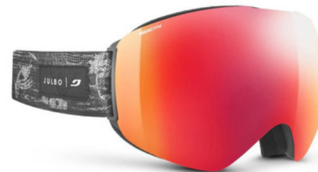
Julbo Skydome REACTIV 2-4