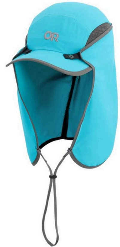
Outdoor Research Sun Runner Cap