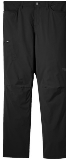
Outdoor Research Men's Ferrosi Pants