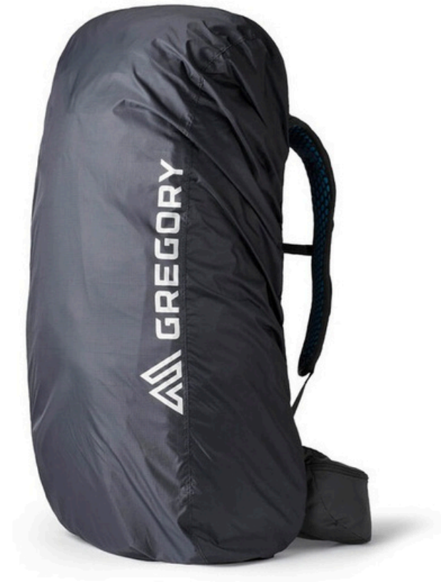
Gregory Rain Cover 30L-50L