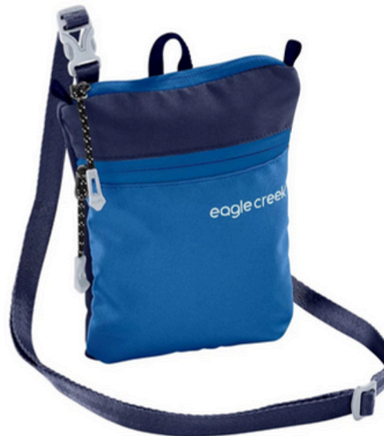
Eagle Creek Stash Neck Pouch