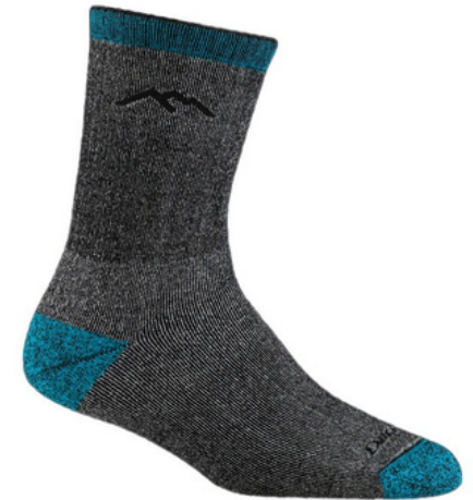
Darn Tough Women's Mountaineering Micro Crew Heavyweight Hiking Sock