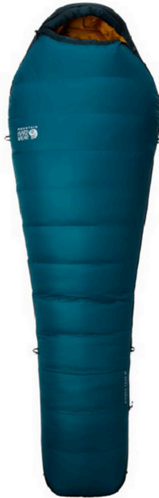
Mountain Hardwear Men's Bishop Pass 0°F/-18°C