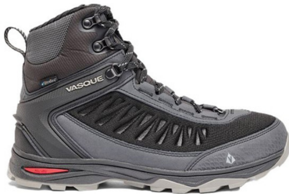
Vasque Women's Coldspark Ultra Dry