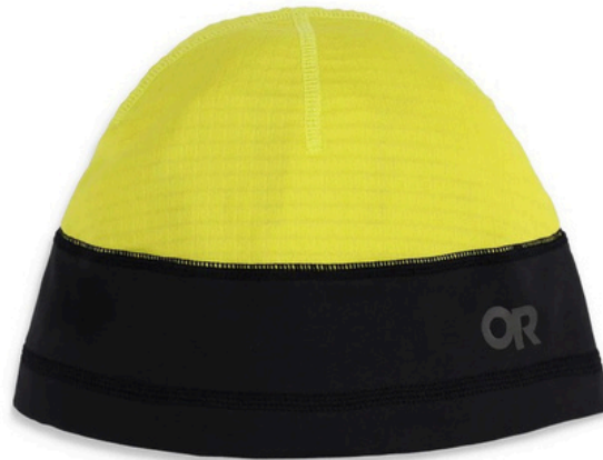
Outdoor Research Vigor Grid Fleece Beanie