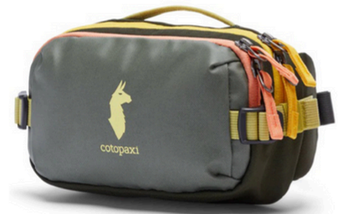
Cotopaxi Allpa X 1.5L Hip Pack