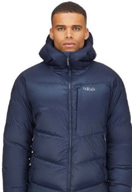
RAB Men's Positron Pro Down Jacket