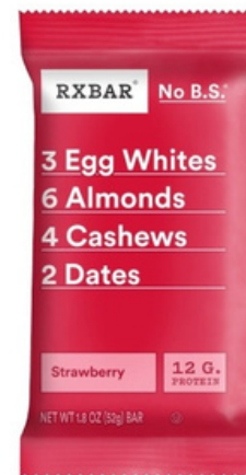
RXBARS Protein Bars