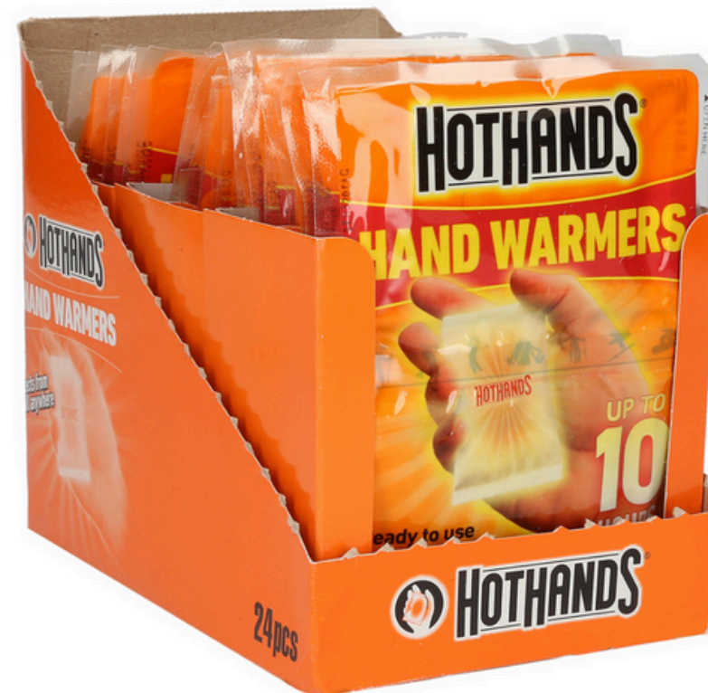
HotHands Hand Warmers