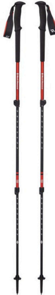
Black Diamond Trail Trekking Poles