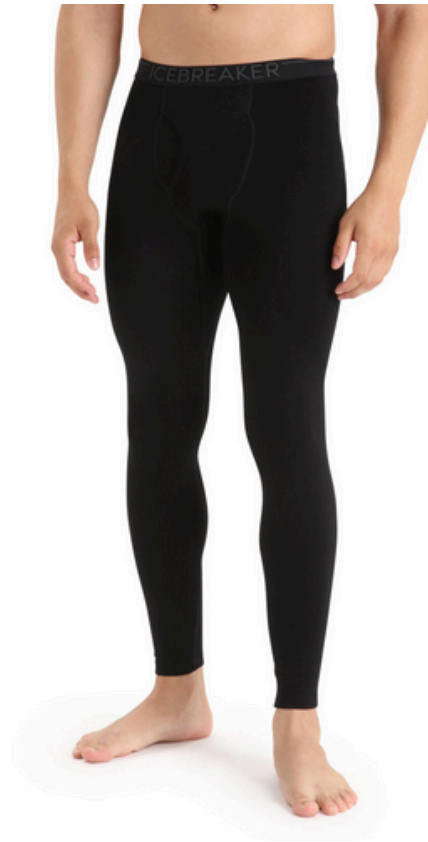
Icebreaker Men's Merino 260 Tech Thermal Leggings With Fly