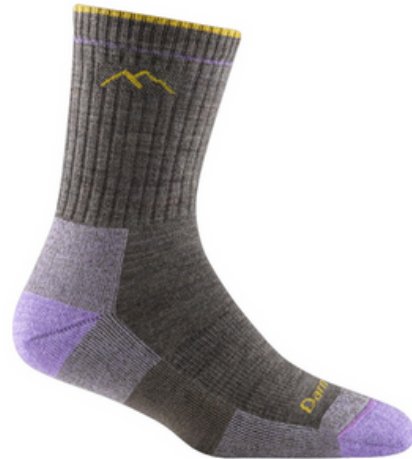
Darn Tough Women's Hiker Micro Crew Midweight Hiking Sock