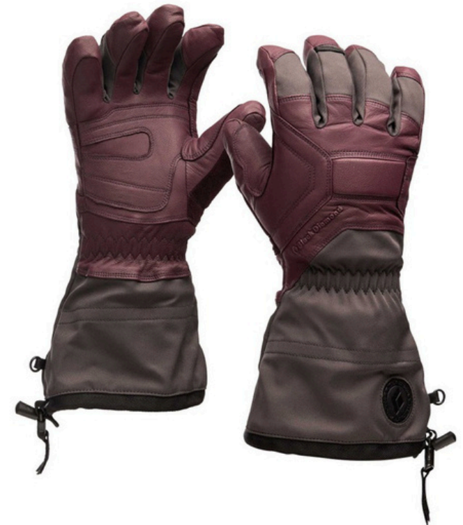
Black Diamond Women's Guide Gloves