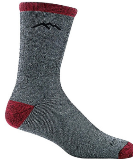
Darn Tough Men's Mountaineering Micro Crew Heavyweight Hiking Sock