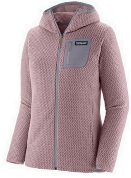
Patagonia Women's R1 Air Full-Zip Hoody