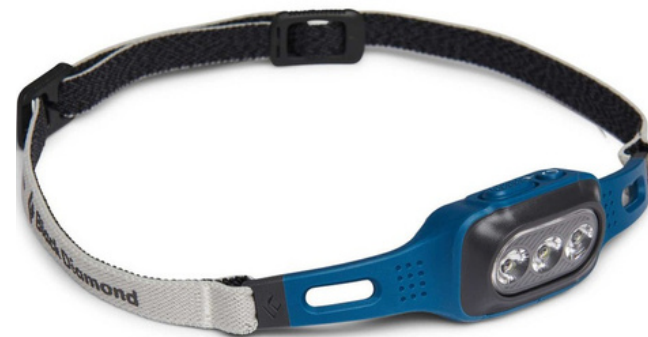
Black Diamond Deploy 325 Headlamp