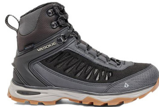
Vasque Men's Coldspark Ultra Dry