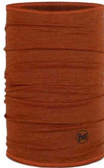
Buff Lightweight Merino Neck Gaiter