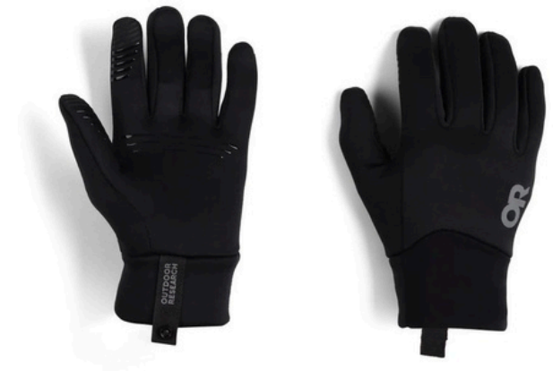
Outdoor Research Women's Vigor Midweight Sensor Gloves