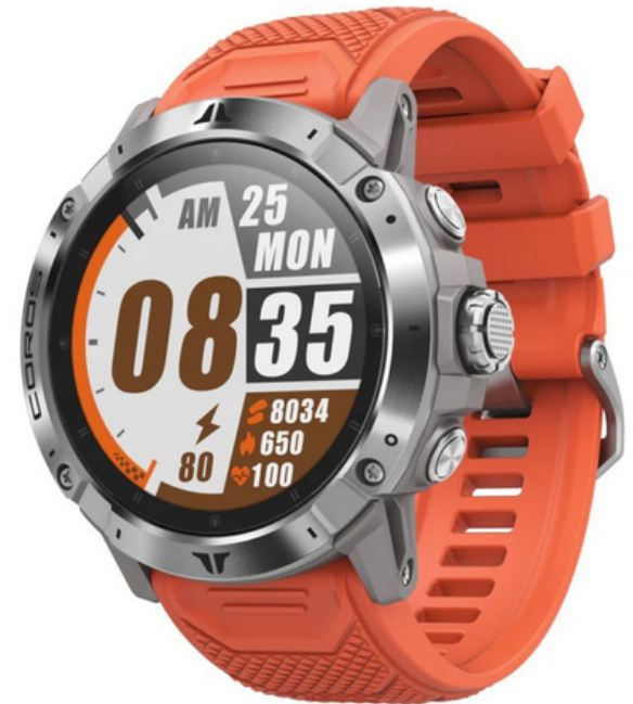
Coros Vertix 2